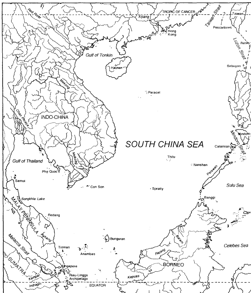
Fig. 1a. The South China Sea, as defined in the present paper.

The lists of fishes provided by the workshop participants from nations bordering the South China Sea were made available, family by family, to systematic ichthyologists who specialize in these families. Those who responded have integrated and updated their respective family lists for this publication. These lists are presented here with the names of the authors who prepared or verified them. Following the lists are selected references suggested by the participants and the checklist authors as the most useful for the identification of South China Sea fishes.