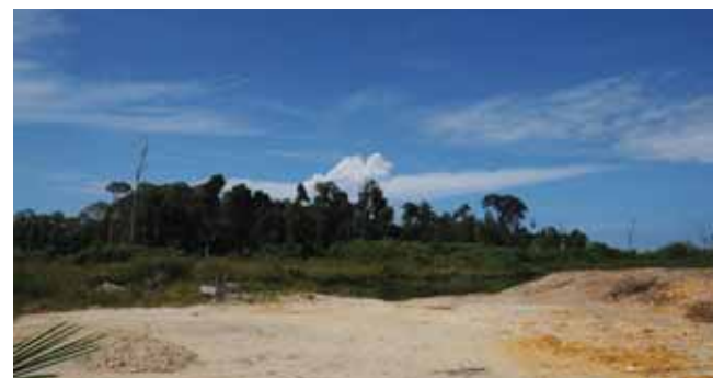
Fig. 5. Fragmented peat swamp locality in Singkil where a remnant population of B. rubra was collected (2009).