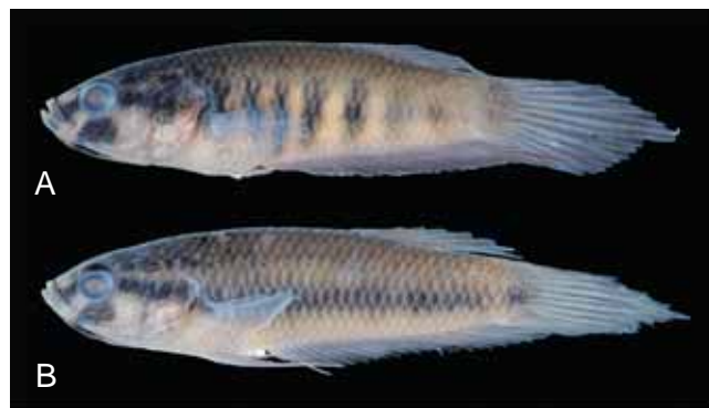
Fig. 7. Betta dennisyongi : A, MZB 17207, holotype, 27.4 mm SL, male; B, ZRC 53990, paratype, 30.0 mm SL female; central Aceh.