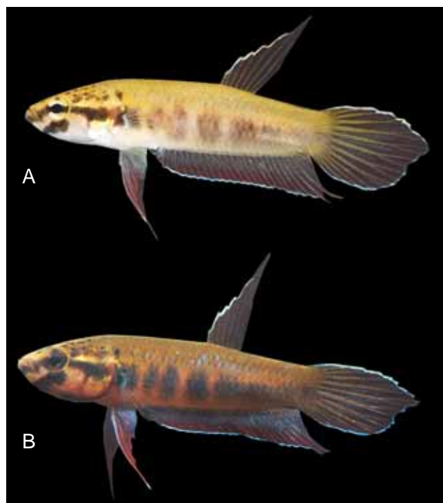
Fig. 8. Betta dennisyongi : A, ZRC 50871, 29.5 mm SL male, colouration in life; B, same specimen, acclimatised colouration.