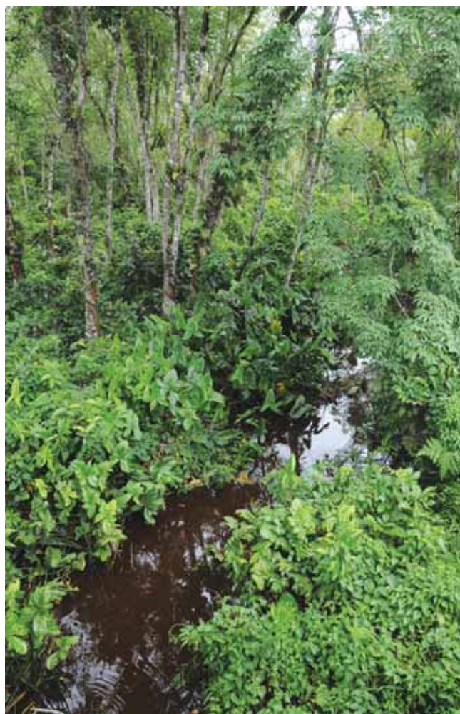
Fig. 9. Type locality of Betta dennisyongi , remnant swamp-forest habitat in central Aceh (2009).

There are two lots of specimens (ZRC 53989 and ZRC 53992) obtained from Aceh Singkil region; but each lot belonging to a different species. The two habitats are very different and could reflect habitat segregation or a natural boundary/extent of distribution of the two taxa. The series ZRC 53989 identified as B. rubra was obtained from peat swamp habitat (presently extirpated due to habitat