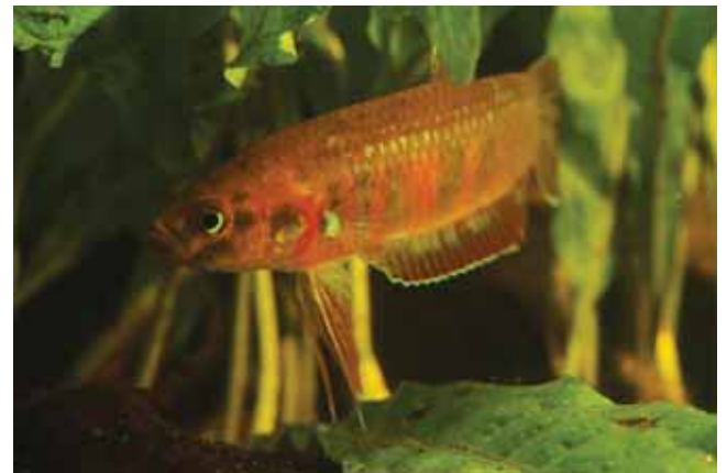
Fig. 4. Betta rubra live male specimen from southern Aceh (from same series as ZRC 53989, not preserved).