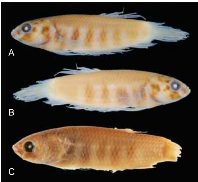
Fig. 2. Betta rubra : A, MSNG 13019a, lectotype, 28.6 mm SL, left side; B, lectotype, right side, Sibolga; C, BMNH 1893.5.29:1, paralectotype, 33.3 mm SL, Lake Toba.