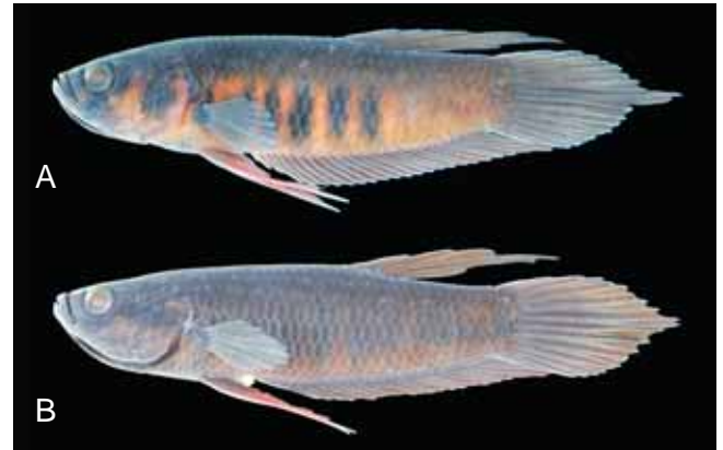
Fig. 3. Betta rubra : A, ZRC 53989, 34.0 mm SL male; B, ZRC 53989, 37.9 mm SL female; freshly collected specimens from southern Aceh.

Diagnosis. — Betta dennisyongi can be distinguished from B. rubra by the following suite of characters: a continuous black postorbital stripe extending up to opercle edge (vs.