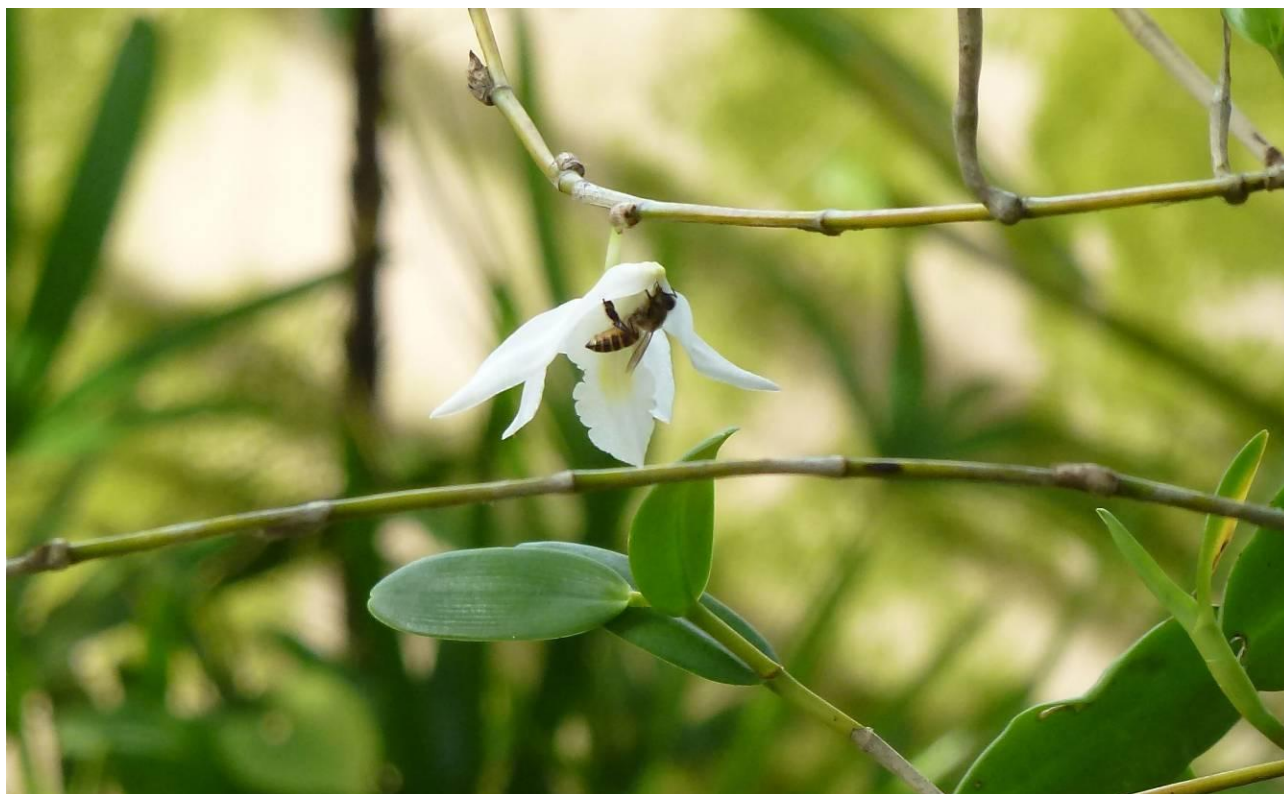
Fig. 5. Lateral view of a bee, Apis cerana , visiting a pigeon orchid flower along Sian Tuan Avenue on the morning of 23 Jul.2012 at 0758 hours.

rapidly from one flower to another, with brief stops at each flower, attempts to photograph this activity allowed us to capture an image of a bee with pollinium successfully attached to its thorax (Fig. 6). Five days later, the number of developing fruits was counted (37 out of a total of 47 flowers), and it was found to have a rather high success rate of pollination (78.7%). The young, green fruits were 10 \times 4 mm and still had the wilted flowers attached to their apices (Fig. 7).