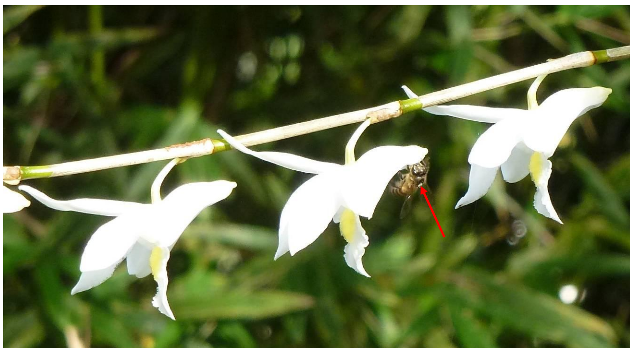
Fig. 6. Frontal view of a bee, Apis cerana , just about to leave a pigeon orchid flower. The pollinium (arrowed) attached to the dorsum of its thorax is just visible. Photographed at 0805 hours on the morning of 23 Jul.2012 along Sian Tuan Avenue. (Photograph by: Yeow Chin Wee).

rapidly from one flower to another, with brief stops at each flower, attempts to photograph this activity allowed us to capture an image of a bee with pollinium successfully attached to its thorax (Fig. 6). Five days later, the number of developing fruits was counted (37 out of a total of 47 flowers), and it was found to have a rather high success rate of pollination (78.7%). The young, green fruits were 10 \times 4 mm and still had the wilted flowers attached to their apices (Fig. 7).