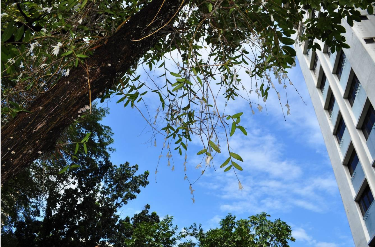
Fig. 1. Epiphytic pigeon orchids ( Dendrobium crumenatum ) growing on a tree in a residential area along Dover Road, photographed on 28 Oct.2011, one day after its full bloom..

The pigeon orchid, Dendrobium crumenatum Swartz is a widespread species within South and Southeast Asia, having been recorded from India, Sri Lanka, Andaman Islands, Myanmar, Indo-China, Malay Peninsula, Sumatra, Java, Borneo, Sulawesi, Philippines, and Taiwan (NIER, 2005). It is an epiphytic orchid that is able to survive from coastal areas to forests, from suburban to urban habitats. In Singapore, this species frequently adorn the branches of mature trees growing along roadsides, in gardens, parks, and forest edges. In residential areas, they are always a welcome sight, especially during their flowering period (Fig. 1).