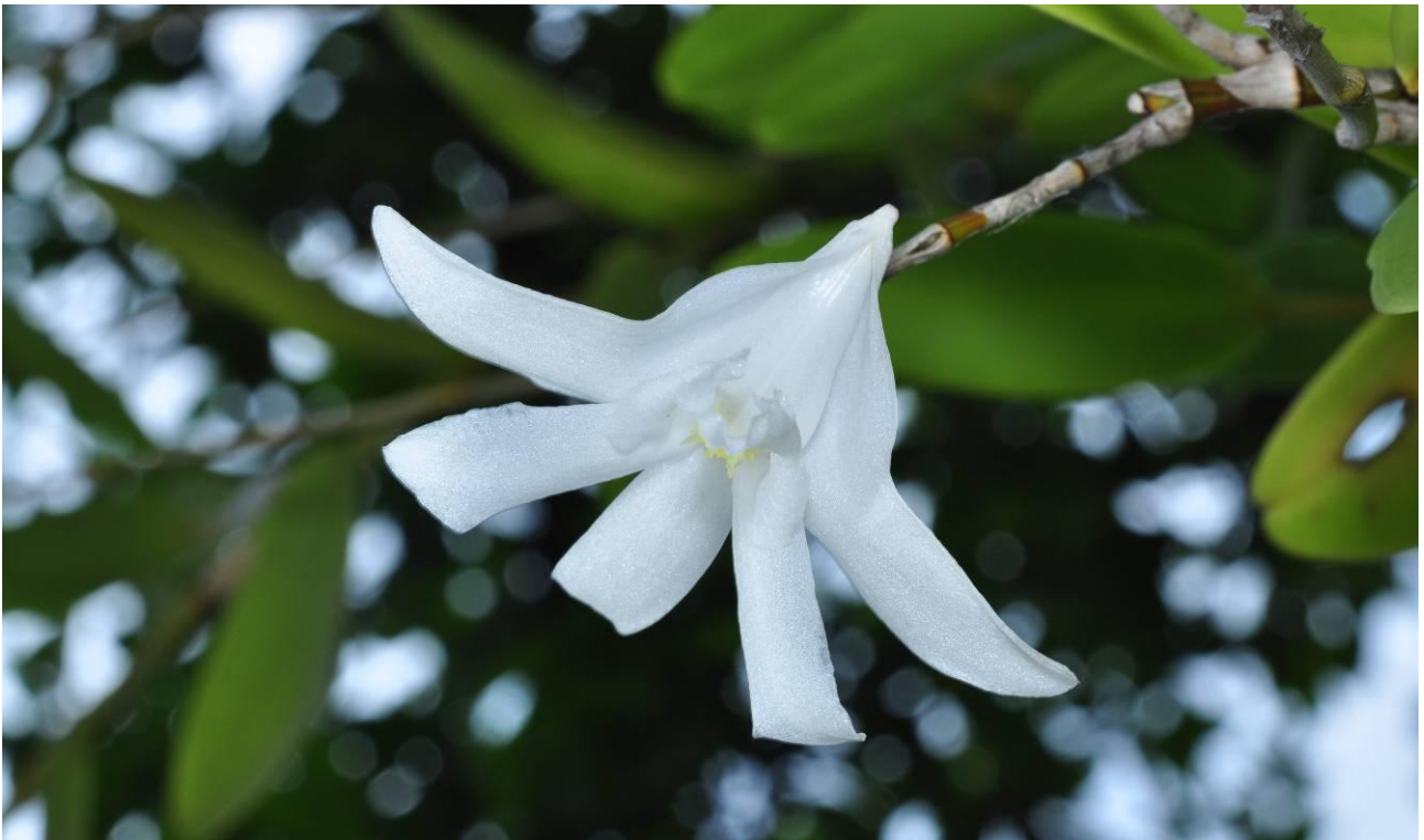
Fig. 3. View of flower (as in Fig. 2) from the underside to appreciate its resemblance to a white pigeon, or dove in flight.