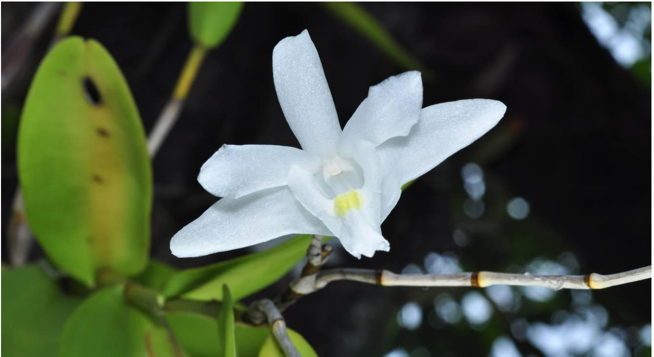
Fig. 2. Characteristic white flower of the pigeon orchid (ca. 3 cm across), photographed along Dover Road on 3 Apr.2012. (Photograph by: Tzi Ming Leong).

Invariably, one becomes conscious of the blooms when the air is thick with their distinctive fragrance. Their flowering is synchronous and lasts for only a day. Despite their flowers being short-lived, they are indeed a sight to behold when one is able to capture this fleeting full bloom. The flower is entirely pearly white, except for a tinge of light sulphur yellow in the middle of its lip (Fig. 2). The reason why it is called a 'pigeon' orchid becomes clear when the flower is viewed from below. From this perspective, the tapering mentum resembles the bird's diminutive head, the dorsal sepal resembles the bird's tail, while the lateral sepals and lateral petals may give the impression of fluttering wings when the pigeon/dove is in flight (Fig. 3).