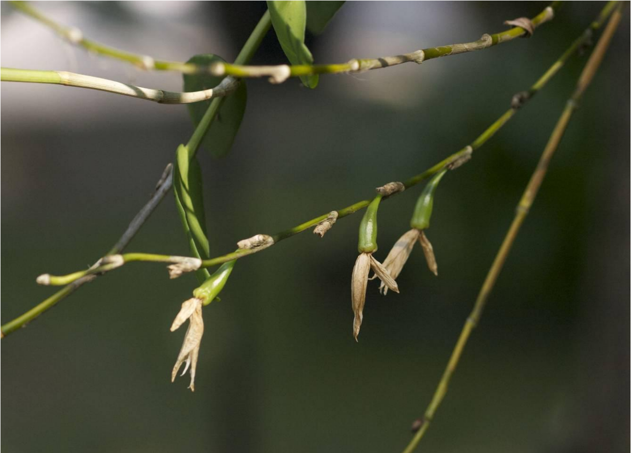
Fig. 7. Examples of young, developing fruits (10 × 4 mm) of the pigeon orchid (as in Figs. 5, 6), measured and photographed on 28 Jul.2012.

In the account of this orchid species by Holttum (1954), he mentioned that the “delightful fragrance...and the white colour of the flowers attract bees, which come soon after dawn and visit the flowers to suck their nectar”. The assumption by Holttum that nectar reward was provided by the orchid remains to be proven or even disproved. It is apparent that many species of Dendrobium are lacking in nectar, and may employ pollination strategies of deception and mimicry to achieve this (Kjellsson et al., 1985). Specific examples of nectarless species from Asia and Australia include Dendrobium infundibulum (Thailand; Kjellsson et al., 1985), Dendrobium monophyllum (Australia; Bartareau, 1995), Dendrobium sinense (China; Brodmann et al., 2009), and Dendrobium speciosum (Australia; Slater & Calder, 1988).