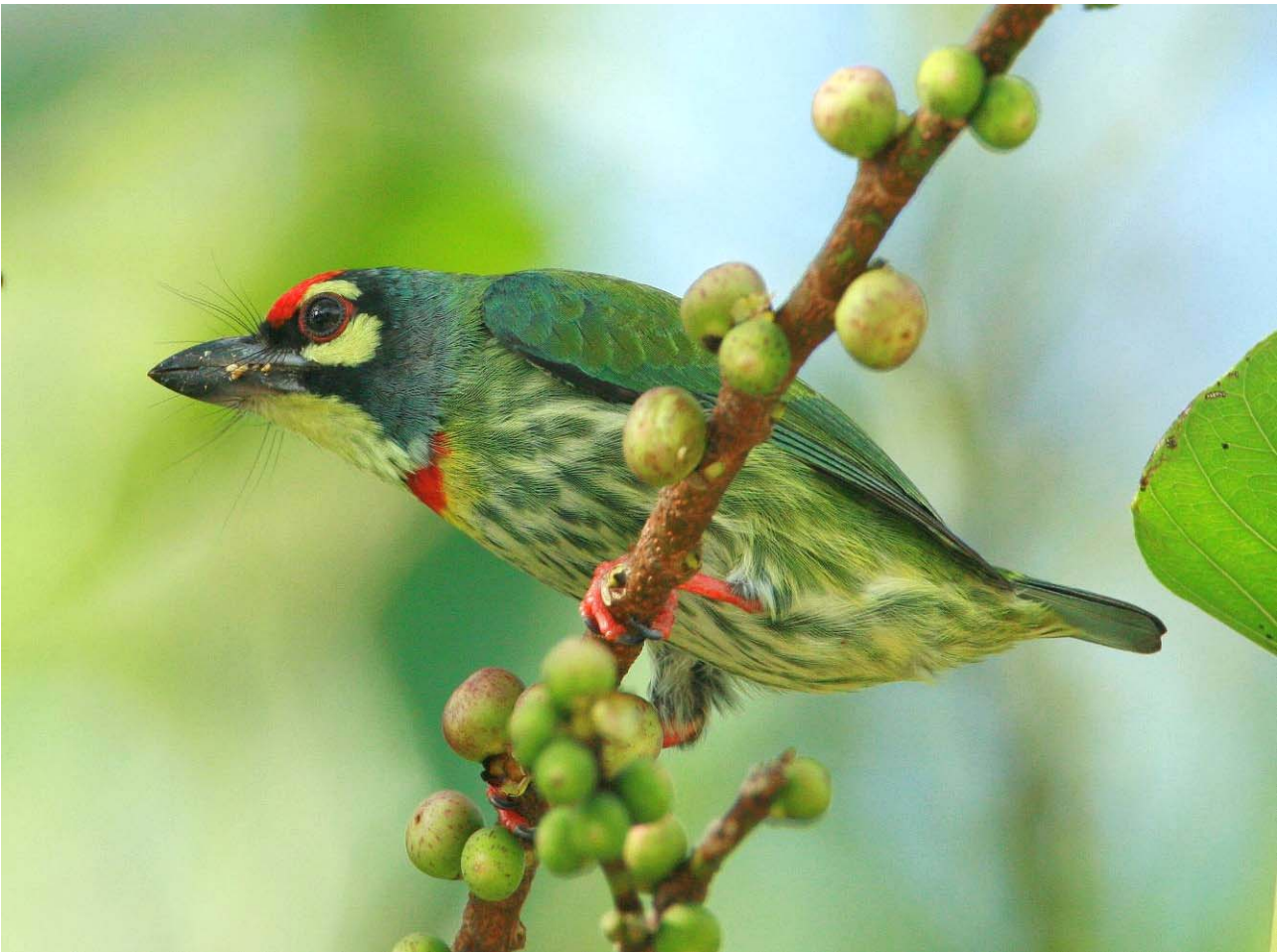
Fig. 1. Megalaima haemacephala indica adult photographed on a bodhi tree ( Ficus religiosa ) branch in Lake View Promenade just outside the Japanese Garden.

foods for feeding its young, immediately after the eggs hatch or when they require nutrients essential for growth and development (Shorts & Horne, 2002).