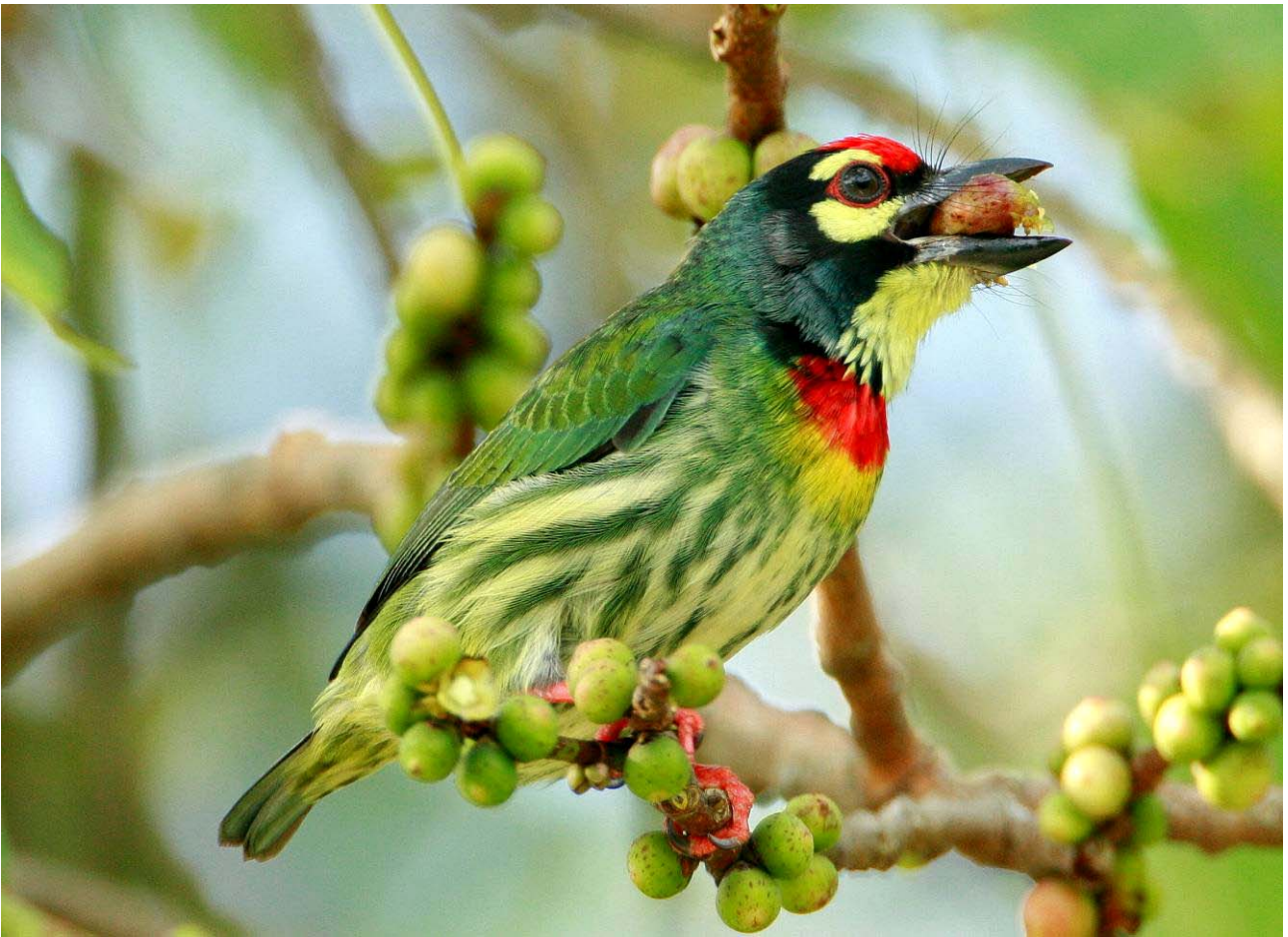
Fig. 2. Adult bird eating a bodhi tree syconium. (Photograph by: Alvin Francis Lok Siew Loon).