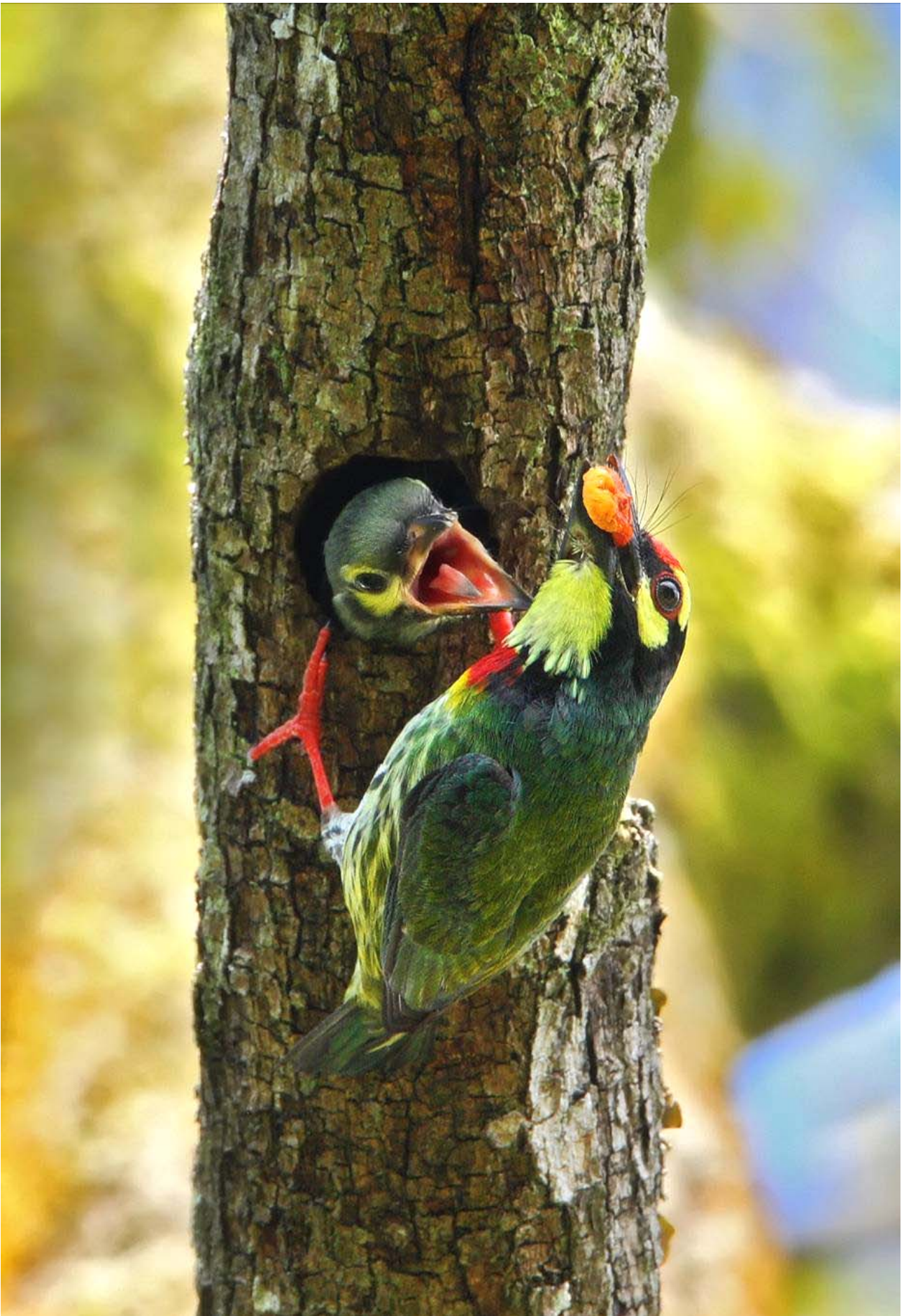
Fig. 6. A parent bird feeding its chick a bodhi tree syconium. (Photograph by: Lee Tiah Kee).