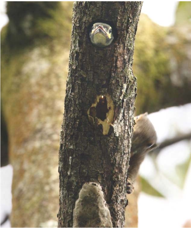
Fig. 8. A plantain squirrel seen gnawing away at the nest site, causing the chick to abandon the nest.