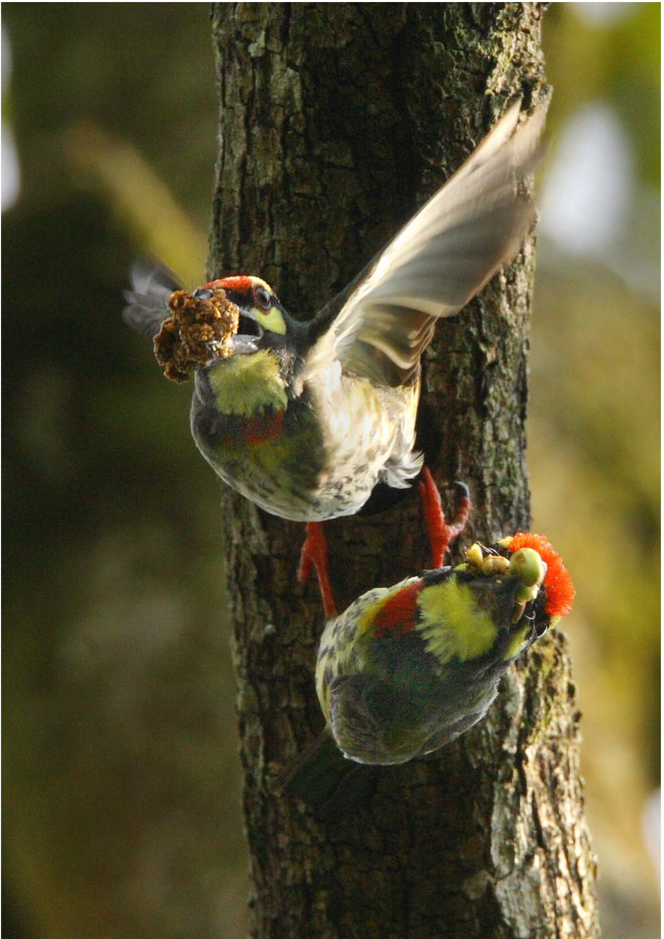
Fig. 7. A parent bird removing faecal material from the nest hole, while the other parent returns with food.