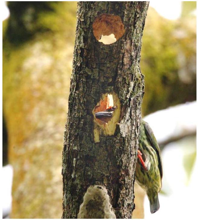
Fig. 9. The worried parent bird returning to the nest to find it badly damaged.

Megalaima haemacephala indica 's song is usually heard throughout the day from a top a tree and consist of a long series of "tok" or "tonk" notes that varies in tempo greatly, but is around 80–200 notes per minute but usually less (Shorts & Horne, 2002; Robson, 2005).