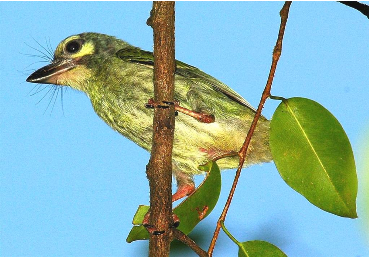
Fig. 4. A dull-coloured immature bird clearly lacking the red of the adult plumage. (Photograph by: Johnny Wee).