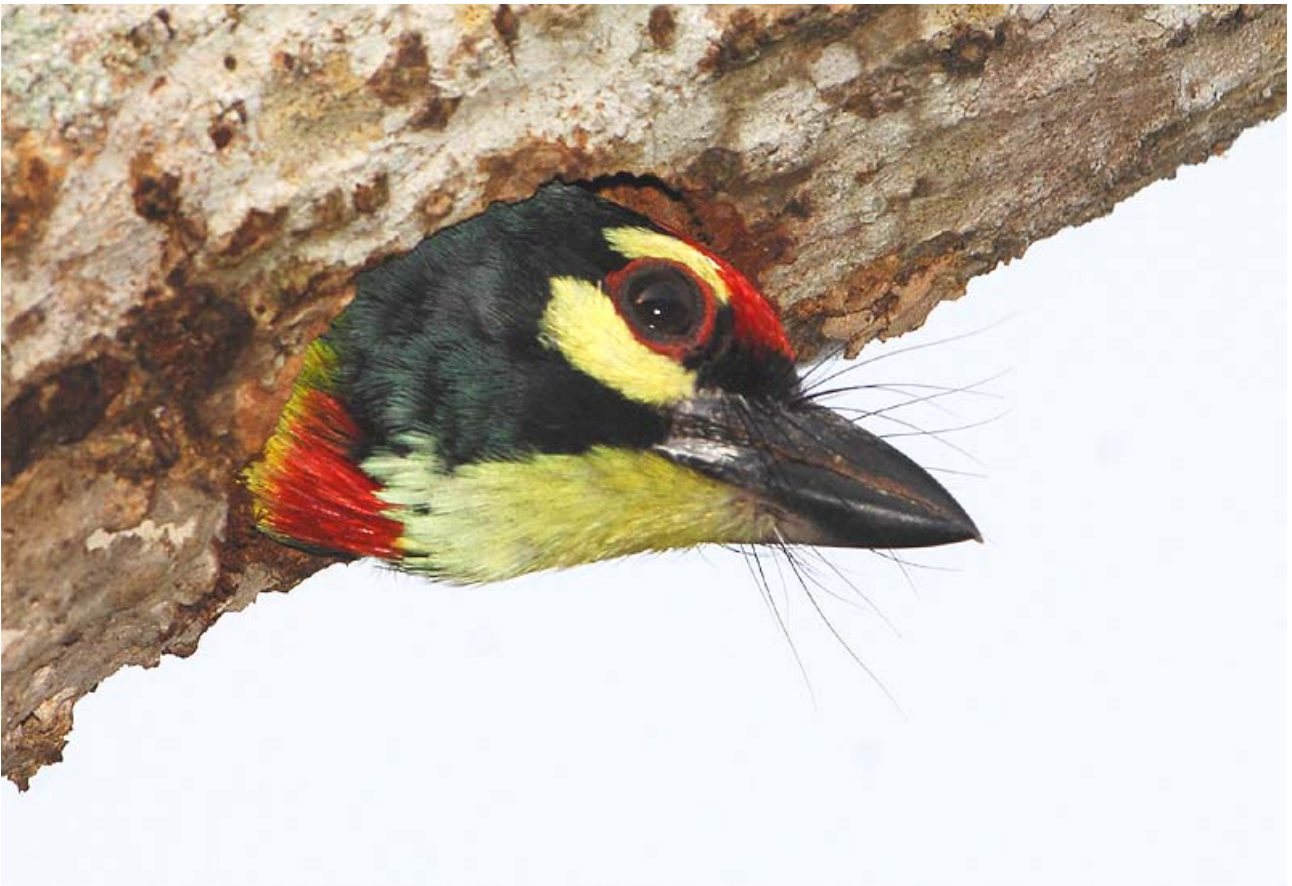
Fig. 5. An adult bird peering out from its nest hole.