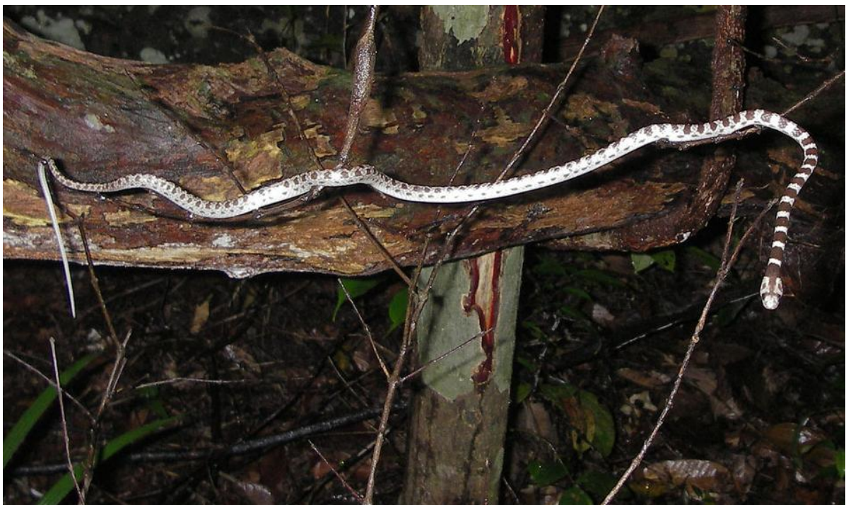
Fig. 4. Malayan bridled snake at Upper Seletar forest on 6 December 2008.

Contributors: Kelvin K. P. Lim , Leong Tzi Ming & Ng Bee Choo Contact address: dbslimkp@nus.edu.sg (Lim)