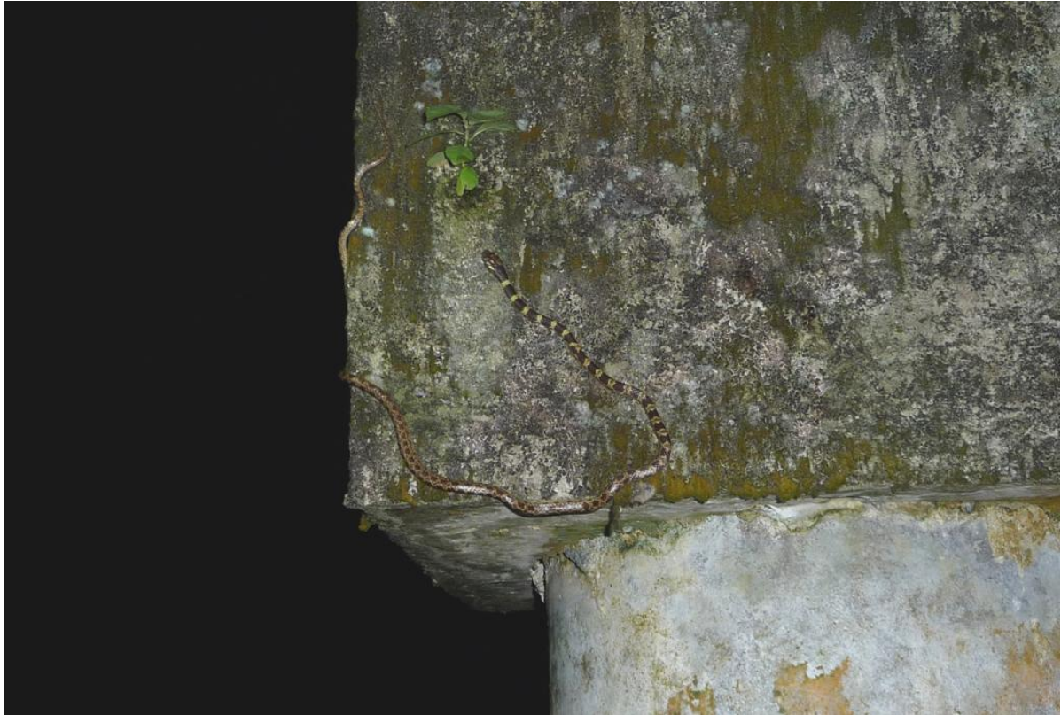
Fig. 3. Malayan bridled snake at Nee Soon swamp-forest on 18 October 2008.