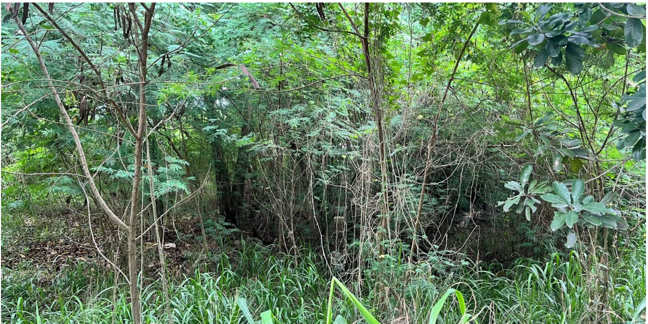
Fig. 1. Habitat where mangrove whistler was observed.

Observations: An adult mangrove whistler was observed hunting for insects (Fig. 2). The bird was tracked, in full view, for about 10 minutes while it moved from branch to branch a few metres off the ground. The bird was not heard vocalising and it did not seem disturbed by the presence of the observer. After some time, the bird confined its hunting behaviour very closely to a particular spot near the upturned stump of a fallen tree. This stump was partially covered with undergrowth consisting mostly of bare intertwined twigs and stems. The bird started to call softly while navigating slowly around the overgrown stump. Then, a conspecific fledgling (Fig. 3) was observed perched about one metre from the ground within the undergrowth. The fledgling did not move or call. The adult bird approached the fledgling and started feeding it. This behaviour was observed multiple times for the next 10 minutes or so. Visual sighting of the fledgling was lost as the birds moved deeper into the vegetation. Shortly after, a second adult mangrove whistler, possibly the second parent, was spotted in a similar habitat around 200 metres from the spot where the first adult and fledgling were observed.