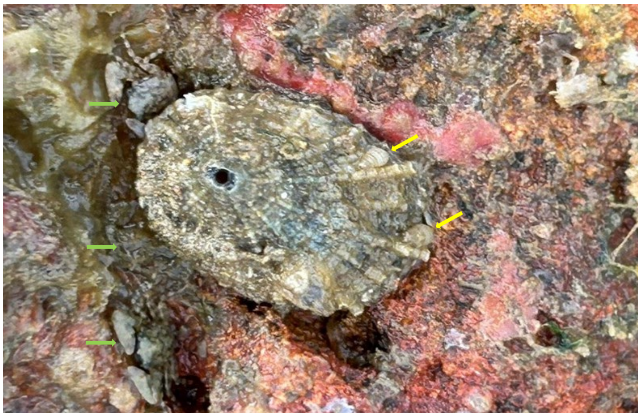
Fig. 1. Dorsal view of the live Diodora octagona in-situ in a rock crevice. There are three small crabs (green arrows) flanking its anterior shell margin and two small parasitic snails (yellow arrows) on the posterior surface of the shell.

Observation: A specimen of about 11 mm shell height was found immobile within a rock crevice. It had two parasitic snails on its shell edge, and three small crabs were noted beside it (Fig. 1). This individual limpet appears to be somewhat deformed as the anterior portion of its shell seems to be smaller, underdeveloped, and having less pronounced ridges in comparison to its posterior part. The specimen was taken as a voucher. After cleaning, the shell was noted to have an ovate shape, rather elevated, and ribbed with thin, broadly granulated, scaled ridges. The orifice is ovate, rather broad and inclined to the shell's anterior region. The shell is generally whitish with irregular, broad, dark brown markings that can also be seen on the shell's interior surface (Figs. 2–7).