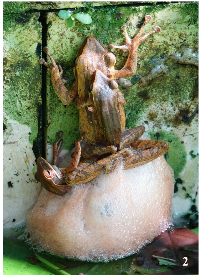
Fig. 1. Lateral view of the pair of frogs in amplexus and the male with his lower body embedded in the foam nest. Fig. 2. Dorsal view of the frogs in amplexus and lateral view of the male stuck in the foam nest.