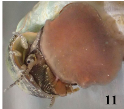
Fig. 1. Pond in Punggol Park with a population of Tarebia granifera consisting of a high proportion of aberrant individuals. Fig. 2. Abapertural view of the sample of 13 snails, all with deformities on their shells. Space between black bars is 1mm. Fig. 3. Abapertural view of shell with wavy markings, and in which a pearl (indicated by arrow) was found. Note abnormal wavy pattern on corroded spire and channelled suture on the last whorl of the shell. Fig. 4. Apertural view of shell with crooked spire and abnormal wavy pattern on surface. Fig. 5. Abapertural view of shell with eroded surface. Fig. 6. Abapertural view of shell with disruption of colour pattern. Fig. 7. Apertural view of shell with partially open umbilicus (indicated by arrow). Fig. 8. Abapertural view of shell with colour pattern disruption and inflated body whorl relative to the spire. Fig. 9. Aperture of shell showing channelled suture with holes. Fig. 10. Aperture of shell showing slit (indicated by arrow) near the last whorl suture. Fig. 11. Ventral view of live snail showing the head and pinkish foot.