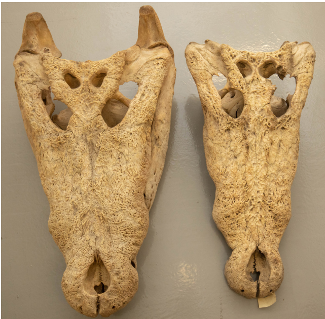
Fig. 1. Exceptionally large skulls of Crocodylus porosus Schneider, 1801 discovered at the Lee Kong Chian Natural History Museum (LKCNHM). Edgar on left and Giryu on right.

& From Hanitsch (1908). * From Britton et al. (2012). † From Manolis (2006). This skull is also reported by Whitaker and Whitaker (2008), but measurements in Manolis (2006) are considered more accurate since the skull was bleached and damaged after 2006. † From Webb & Messel (1978). ^ Not measured but estimated.