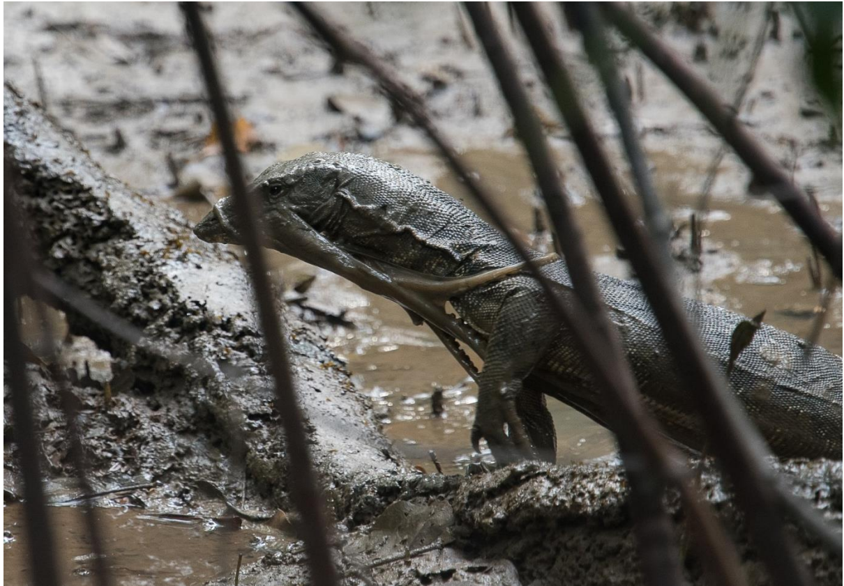
Fig. 1. Octopus attempting pull itself out of the lizard's jaws with its tentacles.