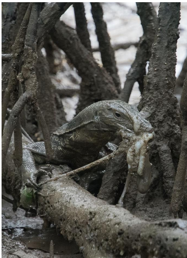
Fig. 2. Lizard attempting to dislodge the tentacles of the octopus from its body.