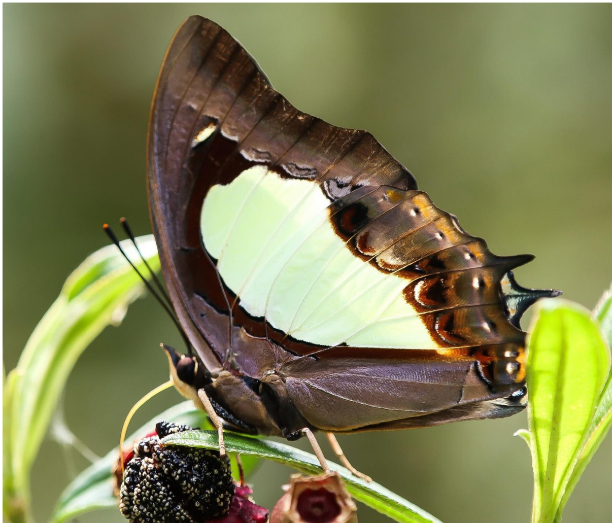
Fig. 2. A Malayan nawab feeding on ripened fruits of Melastoma malabathricum at Butterfly Hill, Pulau Ubin, on 27 October 2018. Note pristine condition of the wings.