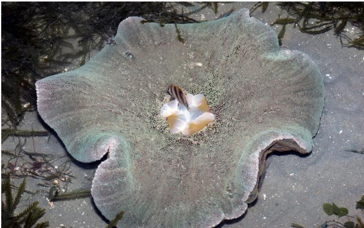
Fig. 3. Dorsal view of a carpet anemone with a kite butterfly fish swimming over the mouth of the anemone.