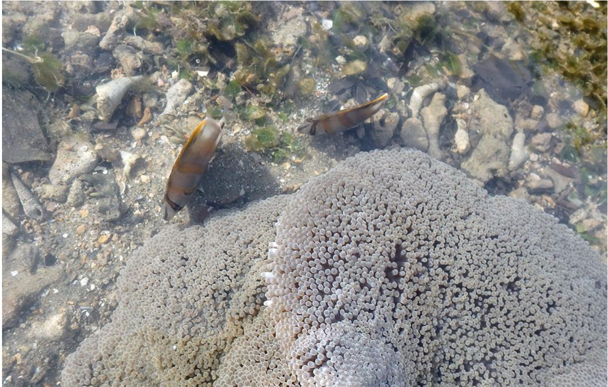
Fig. 2. Dorsal view of two butterfly fish at the edge of a carpet anemone.

Fautin, D. G. & G. R. Allen, 1997. Anemone Fishes and their host sea anemones . Revised edition. Western Australian Museum. vii + 160 pp.