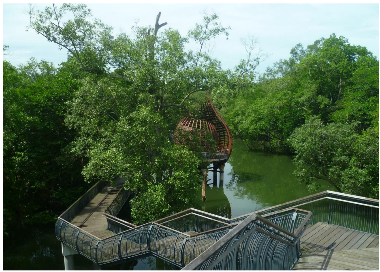
Fig. 2. The jellyfish was spotted in the water behind the shelter in the middle of the picture.