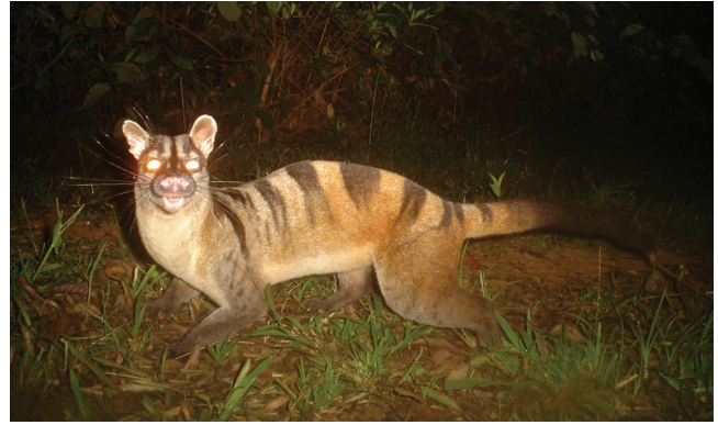
Fig. 1. Banded civet Hemigalus derbyanus camera-trapped in Ulu Segama Forest Reserve, Sabah, Malaysia, on 10 April 2007 (Photograph by: Joanna Ross and Andrew Hearn).

The banded civet has been listed under CITES Appendix II since 1975. This requires an export permit for trade, but no import permit is needed unless stipulated by national law. Within Borneo, the banded civet is included on Schedule 2 of Sabah's Wildlife Conservation Enactment 1997, meaning that it cannot be hunted or traded without a licence. In Sarawak the species is protected under Part 2 of the First Schedule of the Wildlife Protection Ordinance 1998. In Brunei and Indonesia it is not legally protected. However, in Indonesia