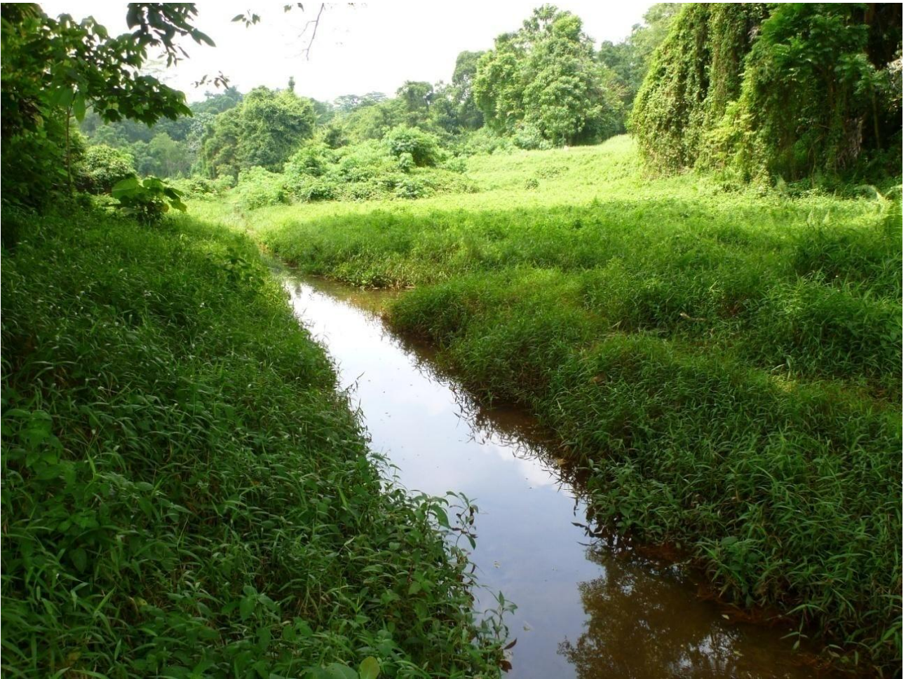
Fig. 2. Stream habitat at Bukit Brown (Jul.2012).