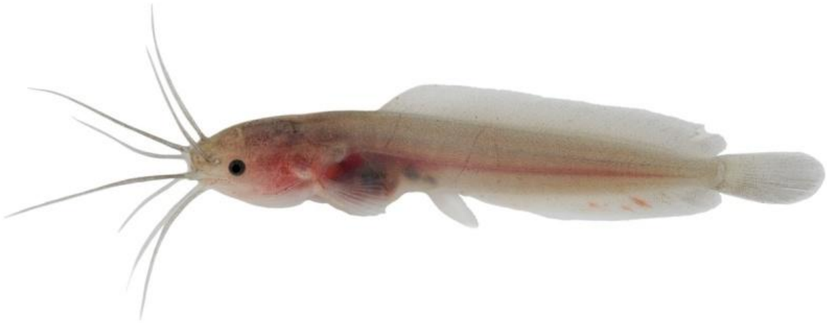
Fig. 5. Clarias batrachus juvenile from Bukit Brown, 24.4 mm SL.