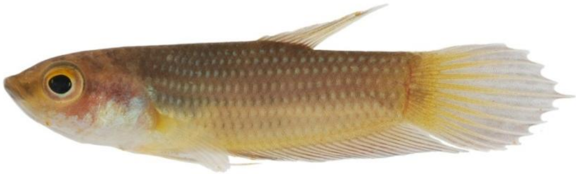
Fig. 8. Betta pugnax from Bukit Brown, 29.6 mm SL.

Found only at the Mount Pleasant Stream. This is the first record in Singapore of this popular ornamental fish which is native to subtropical East Asia (Freyhof & Herder, 2002). That more than two individuals were obtained during the surveys suggests the possibility of this alien species breeding in the stream.