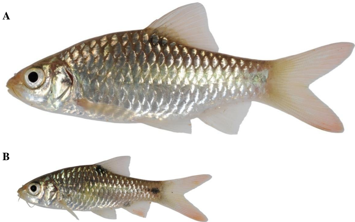
Fig. 4. Systomus rhombeus from Bukit Brown: A, adult, 56.4 mm SL; B, juvenile, 31.6 mm SL. Note the presence of a small black blotch at the base of the dorsal fin.