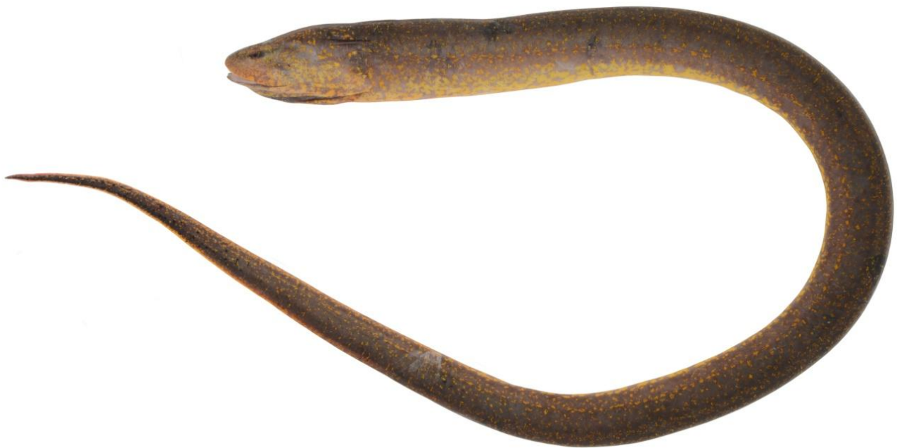
Fig. 7. Monopterus albus from Bukit Brown, ca. 500 mm TL.