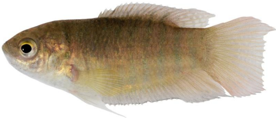
Fig. 9. Macropodus opercularis from Bukit Brown, 37.9 mm SL. (Photograph by: Heok Hui Tan).