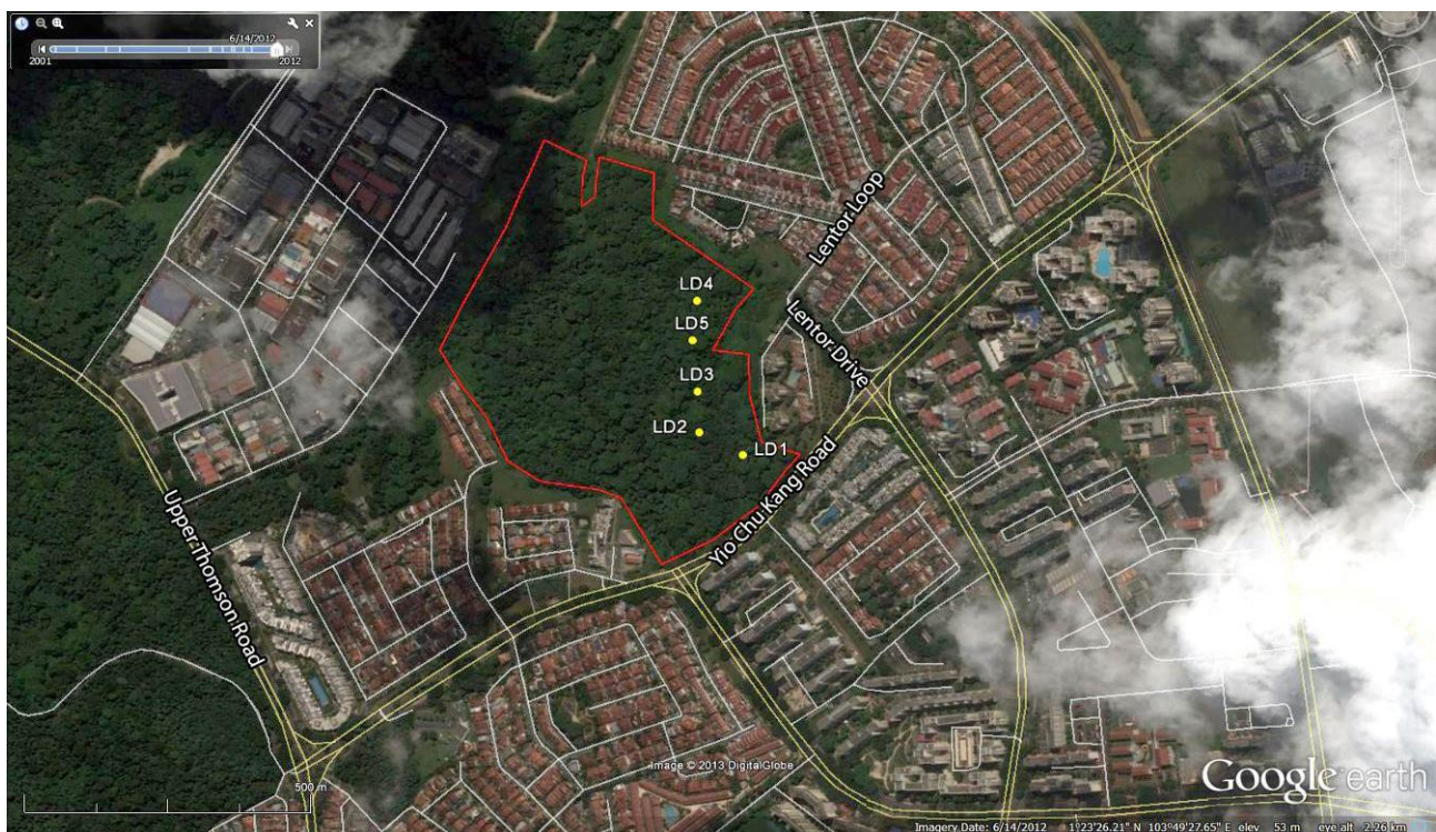
Fig. 1. Lentor Forest and nearby landmarks (Google, 2012). The red outline shows the extent of the forest at 14 Jun.2012 (date that the satellite image was acquired). The locations of surveyed vegetation plots are represented by yellow dots labelled LD1–LD5.

Lentor Forest (01°23'3"N, 103°50'3"E) is a secondary forest that has regenerated on land that was once used for cultivation. It is located in central Singapore, at the junction of Yio Chu Kang Road and Lentor Drive, and it is bounded by private housing estates (Figs. 1, 2A, 2B). Based on Google Earth® satellite images, the total area of Lentor Forest is estimated to be 26.3 ha. Lentor Forest is slated to be cleared for residential developments in the near future (URA, 2008).