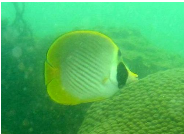
Fig. 4. Chaetodon adiergastos of about 200 mm TL, off Kusu Island on 14 Aug.2011. (Photograph by: Jeffrey Low).