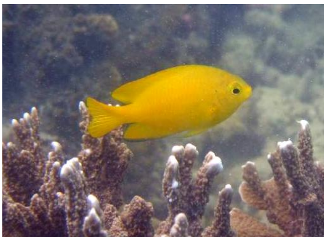
Fig. 5. Pomacentrus moluccensis of about 60 mm TL, off Pulau Satumu on 11 Oct.2008.