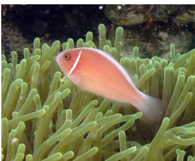
Fig. 7. Amphiprion perideraion of about 90 mm TL, above host anemone off Pulau Tekukor on 2 Oct.2012. (Photograph by: Jeffrey Low).