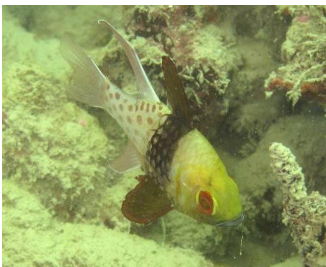
Fig. 6. Sphaeramia nematoptera of about 100 mm TL, off Semakau Landfill on 15 May.2011.