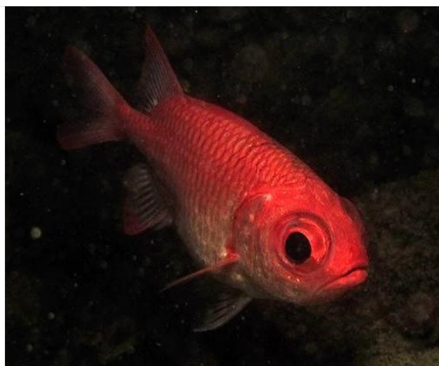
Fig. 3. Myripristis amaena of about 200 mm TL, off Pulau Satumu on the night of 12 Apr.2012.