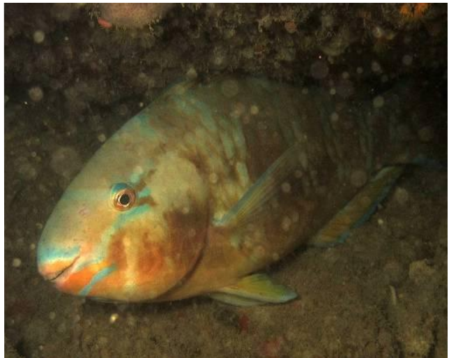
Fig. 9. Scarus ghobban of about 400 mm TL, off Pulau Satumu on the night of 12 Apr.2012. (Photograph by: Jeffrey Low).