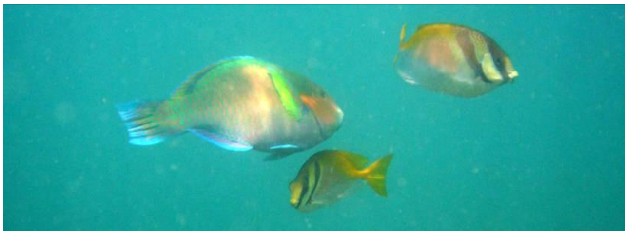
Fig. 10. Scarus rivulatus , male of about 450 mm TL with two rabbitfish ( Siganus virgatus ) off Pulau Satumu on 15 Dec.2010. (Photograph by: Jeffrey Low).

The butterflyfish, Chaetodon adiergastos , however, might be a released aquarium pet. Many butterflyfish are popular ornamental fishes. The island where it was observed is the site of a Buddhist temple, and animal release is a tradition that continues even in modernised Singapore. This assessment is further supported by four years of fish surveys at the site (pers. obs.), which had not recorded this species; nor has it been seen again since. However, the panda butterflyfish occurs naturally in adjacent areas where it seems to prefer waters with greater visibility, and the occasional individual is likely to stray into Singapore territory.