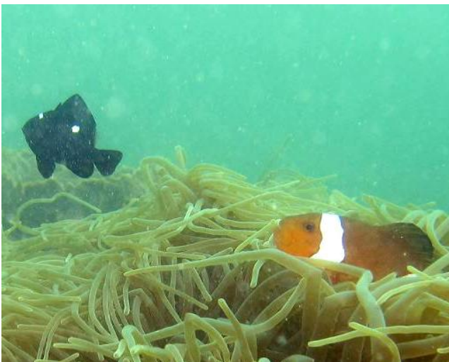
Fig. 8. Dascyllus trimaculatus juvenile (about 20 mm TL) at left, sharing host anemone with a clownfish ( Amphiprion ocellaris ) off Kusu Island on 14 Aug.2011.

Two of the new records for Singapore are cryptic in nature. The soldierfish, Myripritis amaena , which is nocturnal in habits, may well have been overlooked. The urchin clingfish, while not so cryptic, is particularly hard to notice, given its small size, and the tendency of most divers to stay away from sea urchins. The usually murky waters around Singapore also do not give divers enough confidence to get near these prickly creatures.