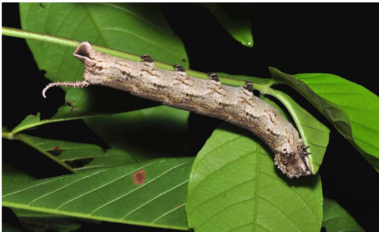
Fig. 1. The final instar caterpillar (brown form) of Acherontia lachesis on its hostplant, Vitex pinnata (Lamiaceae), found in the landward edge of the mangrove forest patch of Pasir Ris Park on the night of 15 Jul.2011 (ca. 2250 hours). Its body length was 95 mm, tail horn length 16 mm.

On the night of 15 Jul.2011 (ca. 2250 hours), a full-grown, brown form caterpillar of Acherontia lachesis (body length: 95 mm, tail horn: 16 mm) was found on a small tree of Malayan teak ( Vitex pinnata L.; Lamiaceae), in the landward edge of the mangrove forest patch of Pasir Ris Park (Fig. 1). It was feeding on leaves just above head-height.