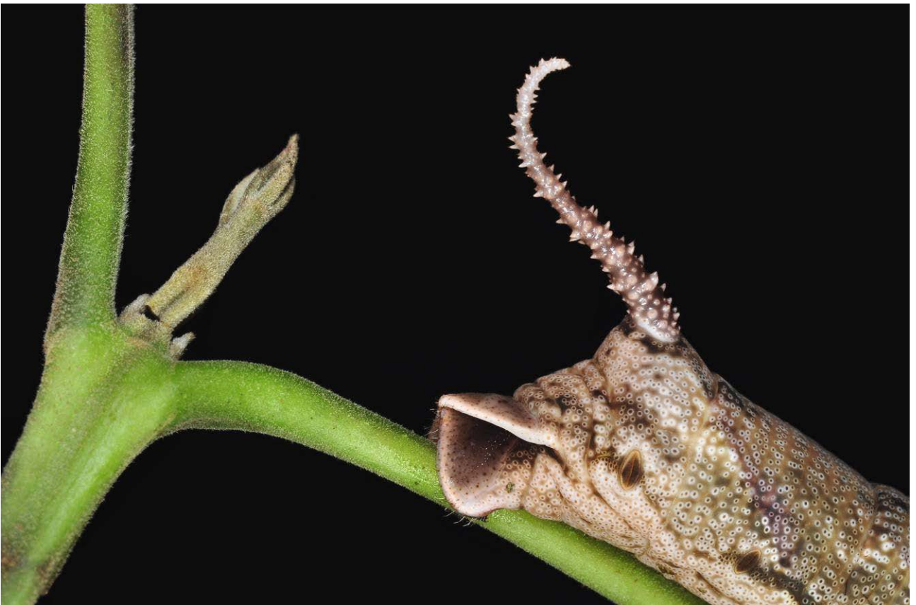
Fig. 5. Posterior close-up to show the shape and ornamentation of the tail horn (16 mm).