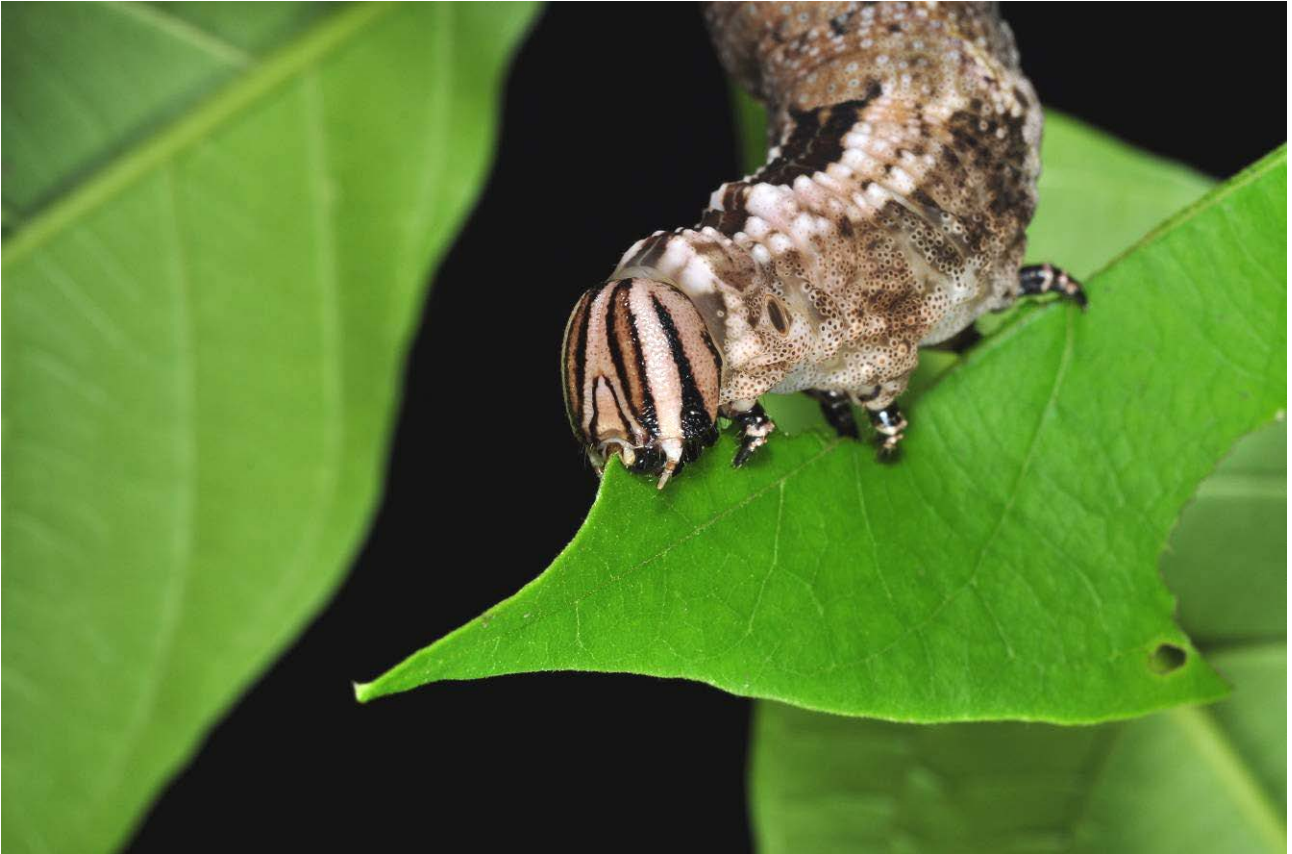
Fig. 6. For most of the day on 16 Jul.2011, the caterpillar demonstrated a healthy appetite and maintained a routine of regular feeding bouts and defecation.