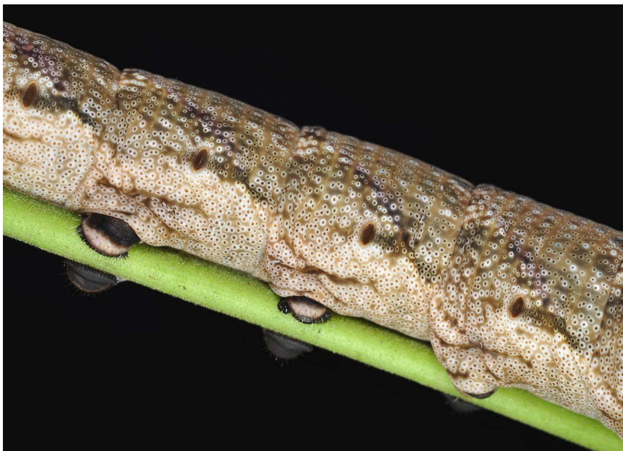
Fig. 3. Lateral close-up of the mid-section to show the dense arrangement of tiny, dark brown dots, encircled with white, and abdominal spiracles.

A brief video clip of the tachinid maggots in the process of devouring the caterpillar host from within was recorded and subsequently uploaded ( http://www.youtube.com/watch?v=TyFjMjaq0A ). Later that same night (ca. 2345 hours), the thoracic region appeared even more deflated and the head capsule had become almost detached (Fig. 8). Its contents must have been consumed, as it was clearly hollowed out. The intolerable stench from the leaked fluids was unrelenting, if not aggravated.