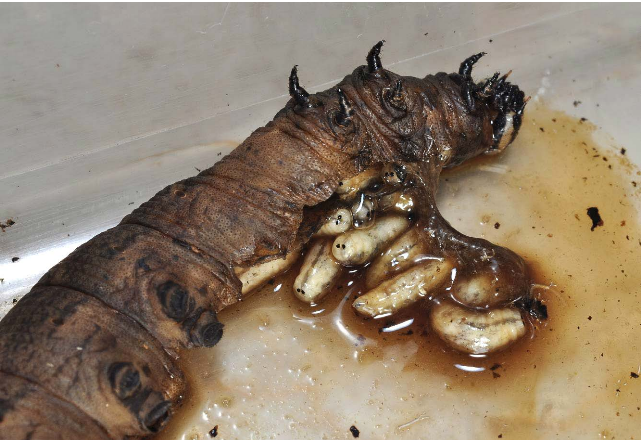
Fig. 7. On the afternoon of 18 Jul.2011 (1745 hours), a group of tachinid maggots (12–15 mm) had advanced into the thoracic cavity of the caterpillar host, consuming the soft tissue and fluid at a steady pace.