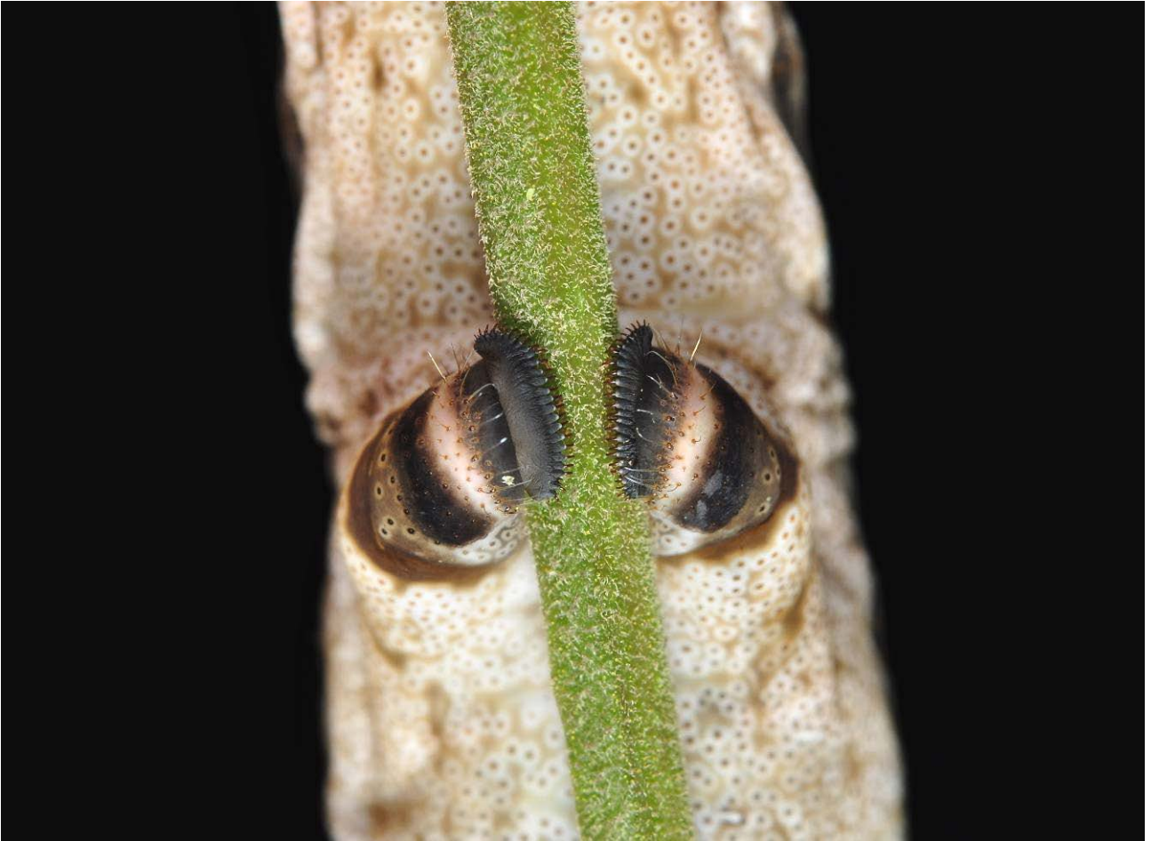
Fig. 4. Ventral close-up of the abdominal prolegs to show the arrangement of crochets used for gripping and climbing.