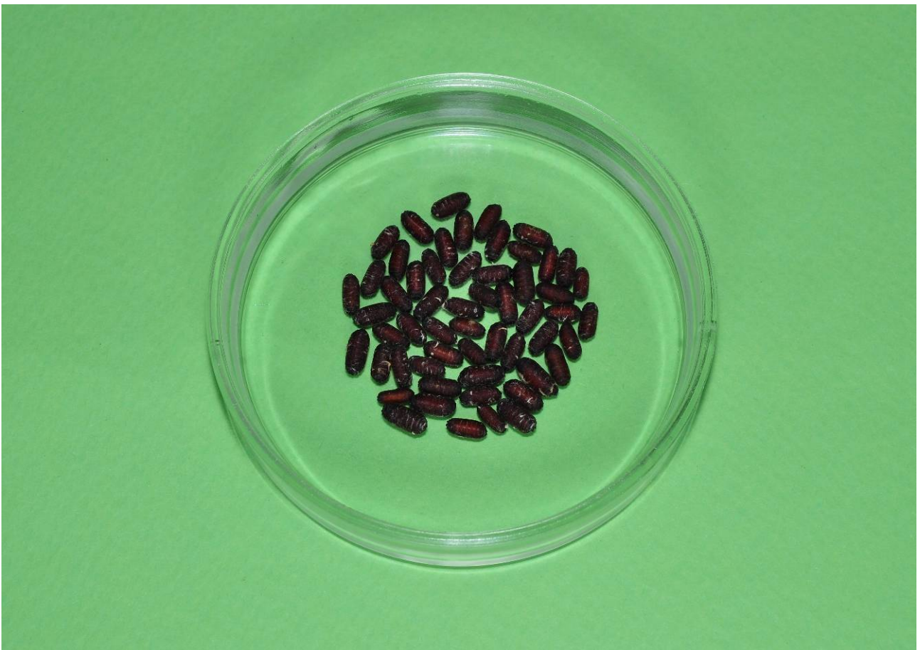
Fig. 9. The maggots began to pupate on the evening of 19 Jul.2011. A total of 56 puparia (lengths: 5–7 mm, widths: 2–3 mm) were counted.