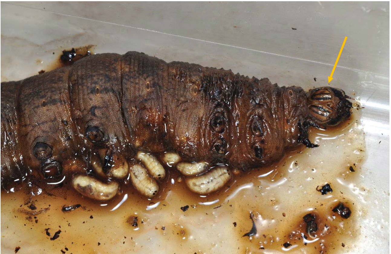
Fig. 8. By the late night of 18 Jul.2011 (2345 hours), most of the thoracic tissue had already been consumed. The head was not spared as well, and dangled as an empty capsule (arrowed) almost detached from the body.