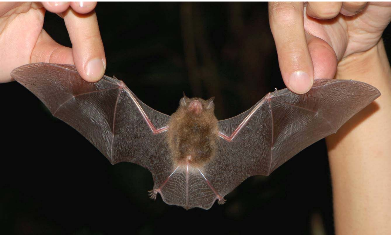
Fig. 6. Female Kerivoula hardwickii from the Upper Peirce Reservoir forest (forearm length: 34.5 mm), one of three individuals (two females, one male) of this bat species captured on the night of 9 Aug.2008.

At a later survey conducted on the night of 9 Aug.2008 at Upper Peirce Reservoir forest, three examples of Kerivoula hardwickii were obtained from two separate harp traps set 300 m apart along a transect. In the first harp trap (checked at 2130 hrs), a female Kerivoula hardwickii was found (Figs. 6, 7; forearm length: 34.5 mm), together with five Rhinolophus lepidus (two males, three females) and one Rhinolophus trifoliatum (male). All bats were temporarily kept in individual cotton cloth bags to prevent subsequent recapture. In the second harp trap (checked at 2230 hrs), a second Kerivoula hardwickii was found (male, forearm: 34.9 mm), together with four Rhinolophus lepidus (three females, one juvenile – sex undetermined). When the first trap was revisited at 2330 hrs, a third Kerivoula hardwickii was caught (female, forearm: 35.5 mm). All bats were eventually released on-site at the end of the survey.