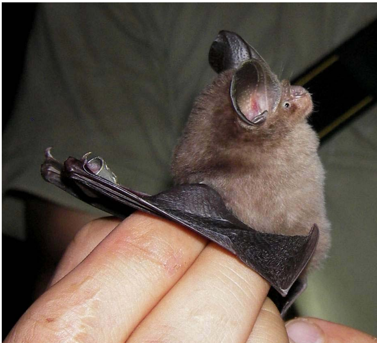
Fig. 2. Side view of the same female Hipposideros bicolor (FRIM #3682), recaptured at the exact same site (North View Path) in the BTNR on the night of 25 Oct.2008, approximately four months later. It was examined and subsequently released. (Photograph by: Kelvin K. P. Lim).