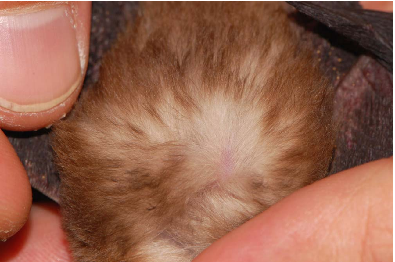
Fig. 3. Close-up detail (dorsal view) of the characteristic bicoloured fur (pale base, greyish brown ends) in Hipposideros bicolor , hence its name, from the BTNR. (Photograph by: Celine Low, 25 Oct.2008).

In the present Bukit Timah and Central Catchment Nature Reserves survey, bats identified as Hipposideros bicolor were eventually obtained on two occasions at the same site in the Bukit Timah Nature Reserve (BTNR). They represent a rediscovery of this species in Singapore after more than 130 years. The first representative was found in a harp trap deployed along the North View Path at the BTNR on 27 Jun.2008. The individual was retrieved just past midnight (28 Jun.2008) and identified by visiting guest researcher, Christine Fletcher [Forest Research Institute Malaysia (FRIM)]. The female bat was examined and banded by Fletcher, who determined that it belonged to the 131 kHz (kilohertz) phonic type (Kingston et al., 2006) within the Hipposideros bicolor species complex. This individual was measured to have a forearm length of 46.0 mm and weight of 8.5 g. It was tagged with a light-weight aluminium band (FRIM #3682) on its right forearm and subsequently released (Fig. 1). In the same harp trap, a male specimen of Rhinolophus lepidus (family Rhinolophidae) was also captured, banded (FRIM #3683) and released.