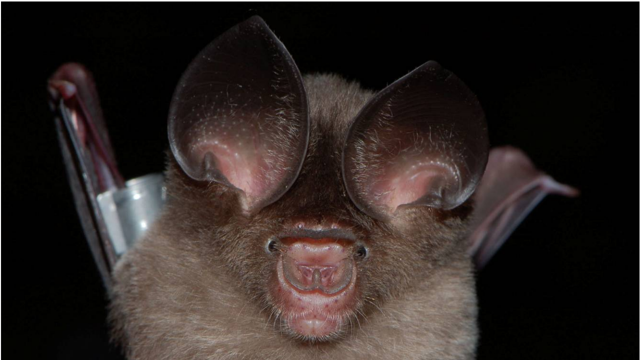
Fig. 1. Front view of a female Hipposideros bicolor (family Hipposideridae) first captured and tagged at the Bukit Timah Nature Reserve (BTNR) on the night of 27 Jun.2008. Note aluminium arm-band (FRIM #3682) on right forearm. Its forearm length was 46.0 mm and body weight was 8.5 g.

Beginning in early 2008, the National Parks Board (NParks) embarked on a series of follow-up faunal surveys within the Bukit Timah and Central Catchment Nature Reserves, in an attempt to monitor the diversity and population status of various taxonomic groups including the bats (order Chiroptera; suborders Megachiroptera and Microchiroptera). Mist nets and harp traps were employed at multiple sites to capture bats at the most suitable locations. Our captures from the harp traps, in particular, proved to be most fruitful and have resulted in: (1) the rediscovery of a species previously thought to be extinct ( Hipposideros bicolor ), and (2) a new bat record for Singapore ( Kerivoula hardwickii ). The details and discussion for the status/discovery of each microchiropteran species are presented here.