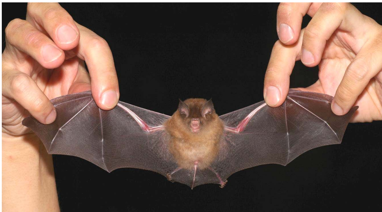
Fig. 4. Female Hipposideros bicolor (ZRC.4.8183, forearm: 46.0 mm, fresh weight: 10.5 g), one of three individuals of this bat species encountered on the night of 25 Oct.2008. (Photograph by: Leong Tzi Ming).

whose calls average 131 kHz. Although they can be distinguished by adult size, those specimens whose measurements fall in the zone of overlap can only be reliably identified by the call. There are, however, subtle differences which can be detected if the two are placed side by side. The 131 kHz form has a slightly flatter and more pinkish noseleaf, while the noseleaf of the 142 kHz form is more grey and curved up along the edges (Francis, 2008). From their sizes, the recent Singapore specimens were assigned to the 131 kHz form. It is not clear to which form the two specimens from The Natural History Museum belong to.