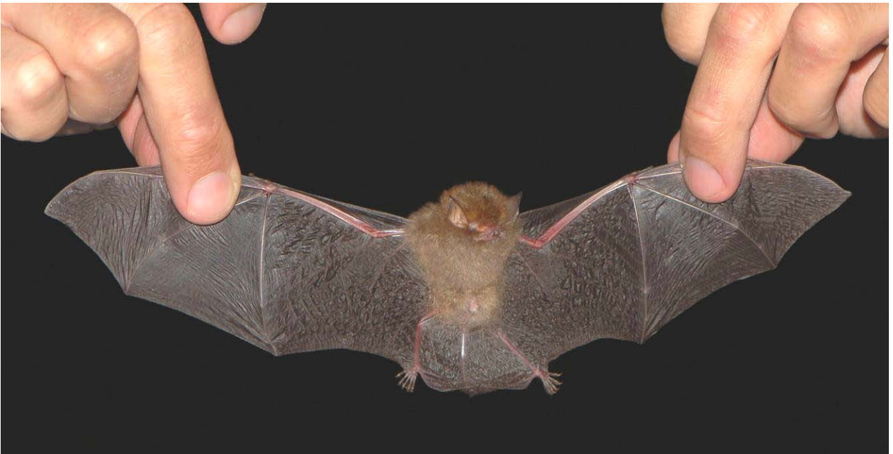
Fig. 5. Male Kerivoula hardwickii (family Vespertilionidae: subfamily Kerivoulinae) from Upper Seletar Reservoir forest, captured on the night of 25 Jul.2008 (ZRC.4.8173, forearm: 31.8 mm, fresh weight: 4.2 g).

At a later survey conducted on the night of 9 Aug.2008 at Upper Peirce Reservoir forest, three examples of Kerivoula hardwickii were obtained from two separate harp traps set 300 m apart along a transect. In the first harp trap (checked at 2130 hrs), a female Kerivoula hardwickii was found (Figs. 6, 7; forearm length: 34.5 mm), together with five Rhinolophus lepidus (two males, three females) and one Rhinolophus trifoliatum (male). All bats were temporarily kept in individual cotton cloth bags to prevent subsequent recapture. In the second harp trap (checked at 2230 hrs), a second Kerivoula hardwickii was found (male, forearm: 34.9 mm), together with four Rhinolophus lepidus (three females, one juvenile – sex undetermined). When the first trap was revisited at 2330 hrs, a third Kerivoula hardwickii was caught (female, forearm: 35.5 mm). All bats were eventually released on-site at the end of the survey.