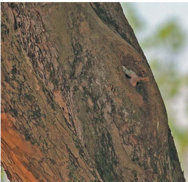
Fig. 12. Southern pied hornbill chick defecating from the opening of the nest.

More and more of the single chick's bill could be seen over time, and by late Apr. it appeared to be observing the world outside its nest. By this time, the whole bill was seen up to and including the eye, and the casque had clearly begun to separate from the rest of the bill.