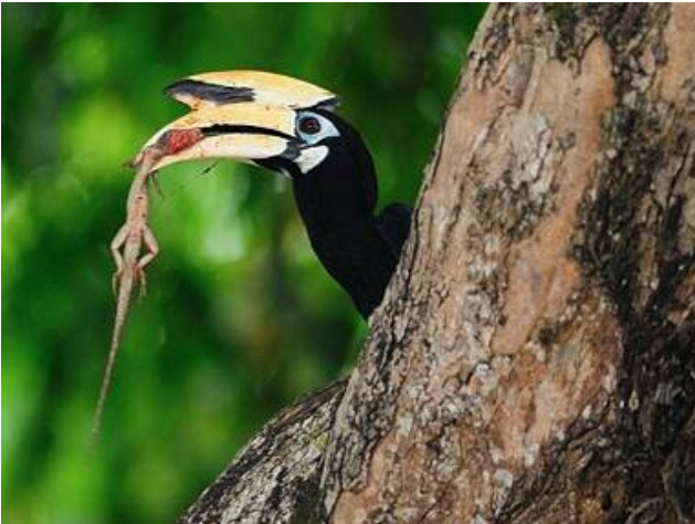
Fig. 4. Male southern pied hornbill with a lizard.