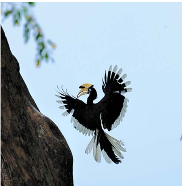
Fig. 7. Male southern pied hornbill arriving at the nest with food.

Male behaviour. – Throughout our observations it is clear that the male hornbill has only one mission in life: the feeding of his mate and their chicks (Fig. 6). From sunrise to sunset (approximately 0700–1900 hours) his entire day is spent foraging for food and bringing this food to the nest (Figs. 7, 8). In addition, of course, he must consume sufficient food himself to fuel his incessant activity. The earliest feeding was seen at 0722 and the latest at 1840 hours.