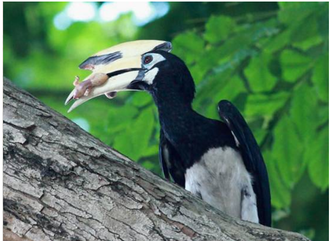
Fig. 5. Male southern pied hornbill with a dead chick.

When the male hornbill was feeding the female and two chicks, 41 complete feeding cycles were observed (departure/return/feeding). The average time away from the nest over these 41 cycles was 34 minutes, with the longest absence being 96 minutes and the shortest being just six minutes, leading to an estimate of approximately 20 feeds per day. However, there was a difference in the timing as the chicks got older and demanded more food; between 14–20 Mar., the average time away was 38 minutes (longest 96 minutes), while between 1–16 Apr., the average time away dropped 26% to 28 minutes (longest 60 minutes). During the 1–16 Apr. observations, the male was seen feeding into the nest on 23 occasions; the average number of food items fed to the female and chicks was 27, the largest was 91 pieces of fruit, and the smallest was just one (a single snail and a single lizard).