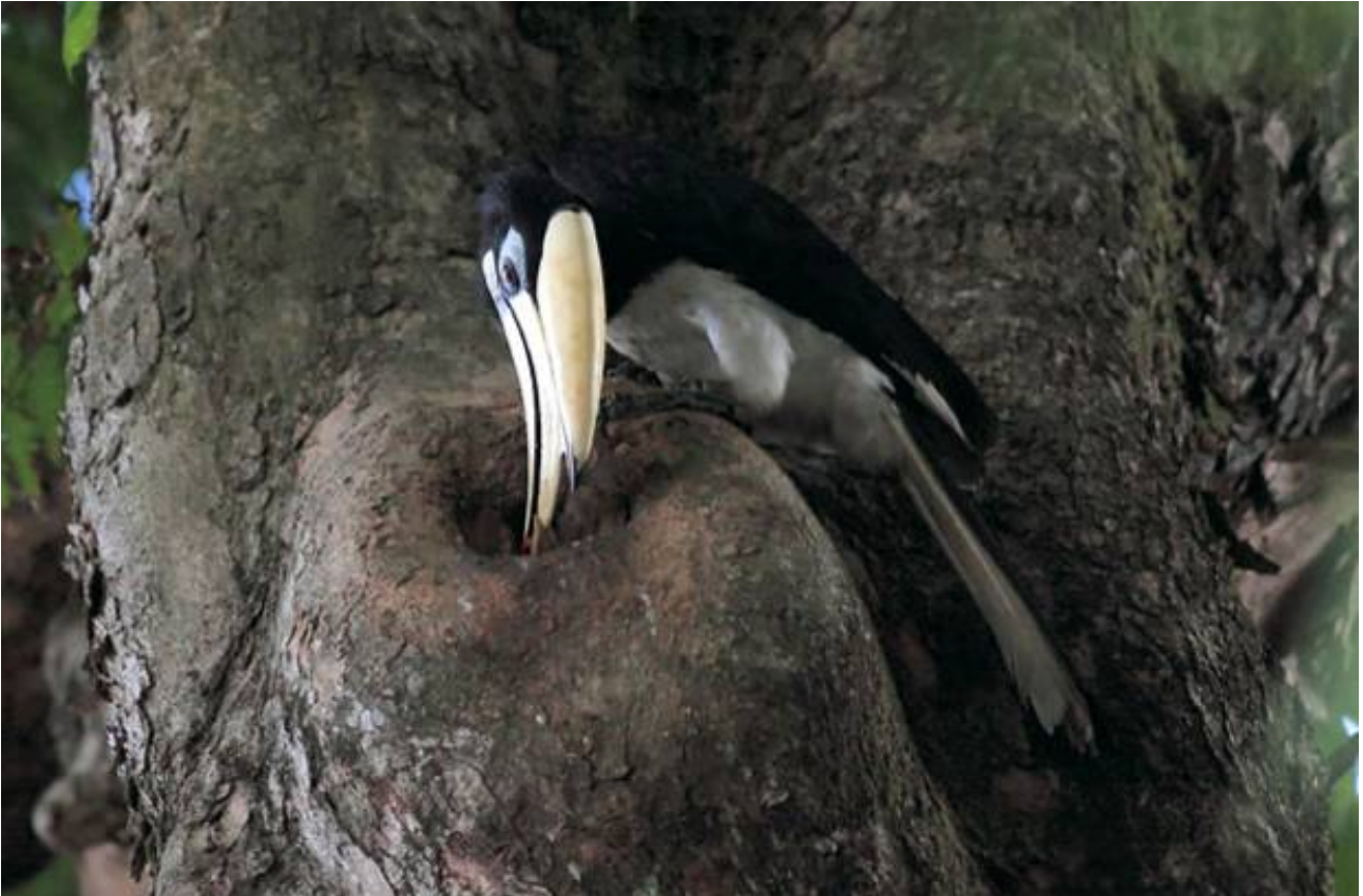
Fig. 6. Male southern pied hornbill feeding his two chicks. (Photograph by: Howard Banwell).

It should be noted that the large bodhi tree ( Ficus religiosa ) at the Hindu temple formed a nearby and frequently used source of fruit for the male bird.