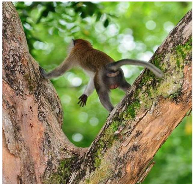
Fig. 13. Long-tailed macaque harassing the hornbill's nest. (Photograph by: Jeff Lim).