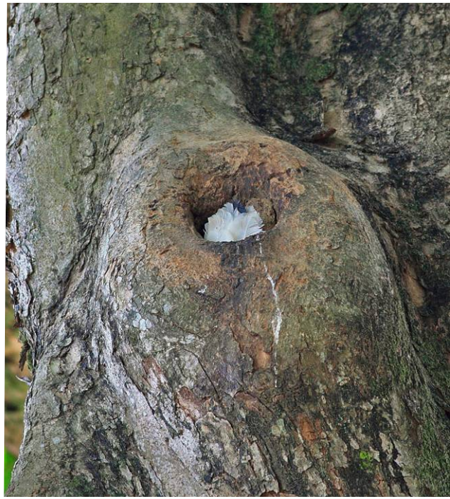
Fig. 11. Tail feathers of the second southern pied hornbill chick seen from the nest opening on 28 Apr.2009.

developing when seen poking out from the nest on 27 Apr. (Fig. 10). A day later the tail feathers were observed at the nest opening (Fig. 11).