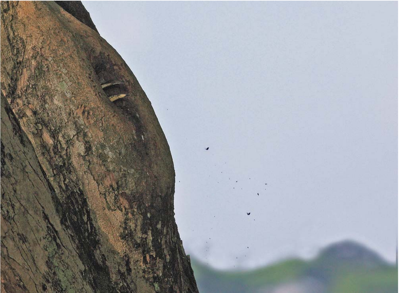
Fig. 9. Female southern pied hornbill cleaning nest cavity. (Photograph by: Howard Banwell).

The male's behaviour pattern changed little throughout the period of observation. Upon returning to the nest site, he would appear quite cautious, perching for a few moments on a nearby tree, or on the nesting tree, sometimes on both, appearing to assess his surroundings for any danger. Interestingly, he was never seen to pay any attention to the human activity going on beneath him, but only look around for natural danger at the nest level.