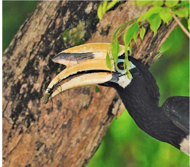
Fig. 3. Male southern pied hornbill returning to the nest with a spider.