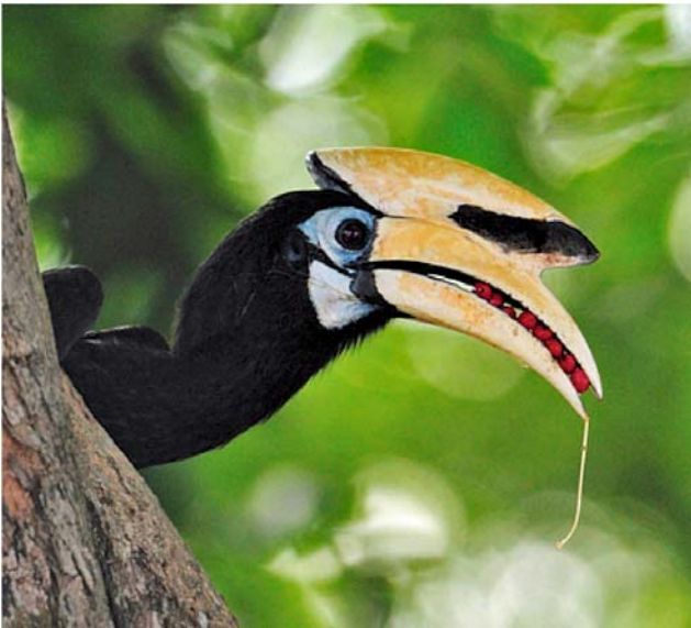
Fig. 2. Male southern pied hornbill regurgitating fruits at the nest. (Photograph by: Jeff Lim).