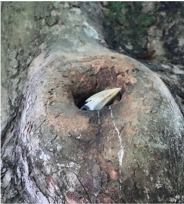
Fig. 10. Bill of the second southern pied hornbill chick showing developing casque on 22 Apr.2009. (Photograph by: Howard Banwell).