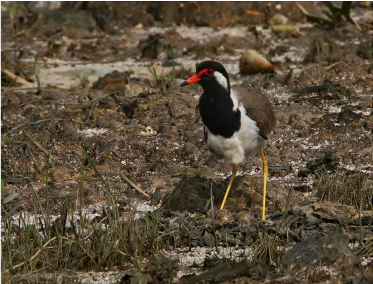
Fig. 12. A few days later only two eggs remained.