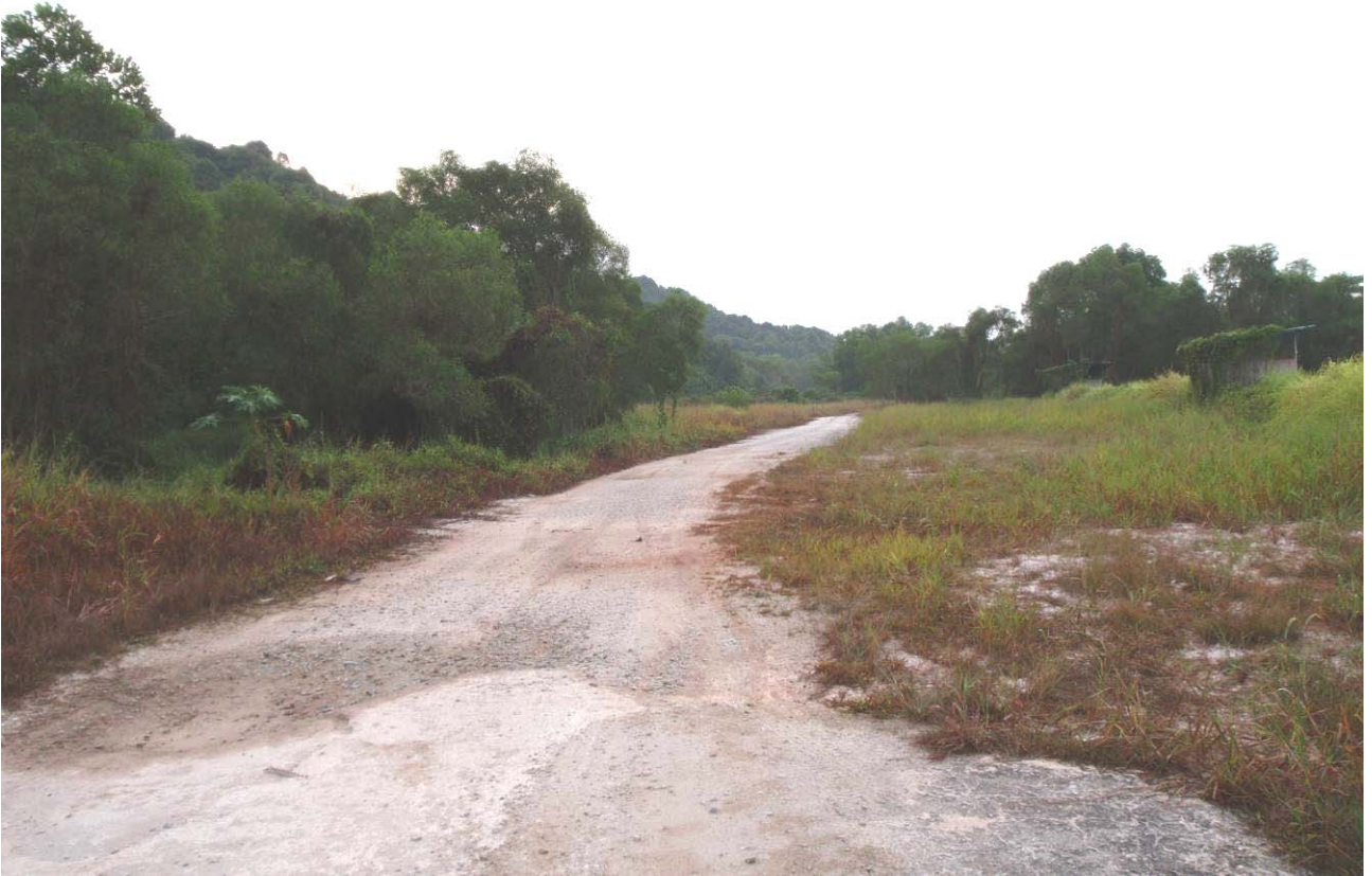
Fig. 8. The third possible nesting site of the red-wattled lapwings adjacent to Tengeh Reservoir. (Photograph by: Alvin Francis Lok Siew Loon).