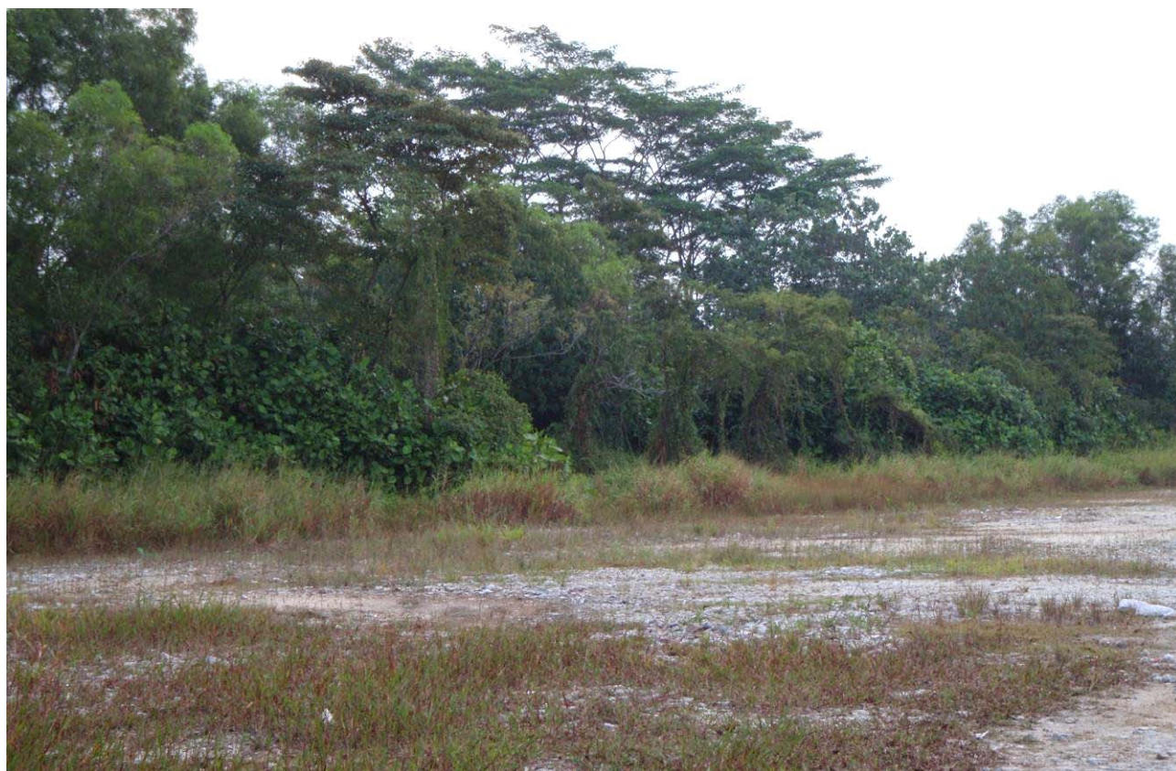
Fig. 7. A open sandy grassy patch adjacent to Tengeh Reservoir where red-wattled lapwings were found.