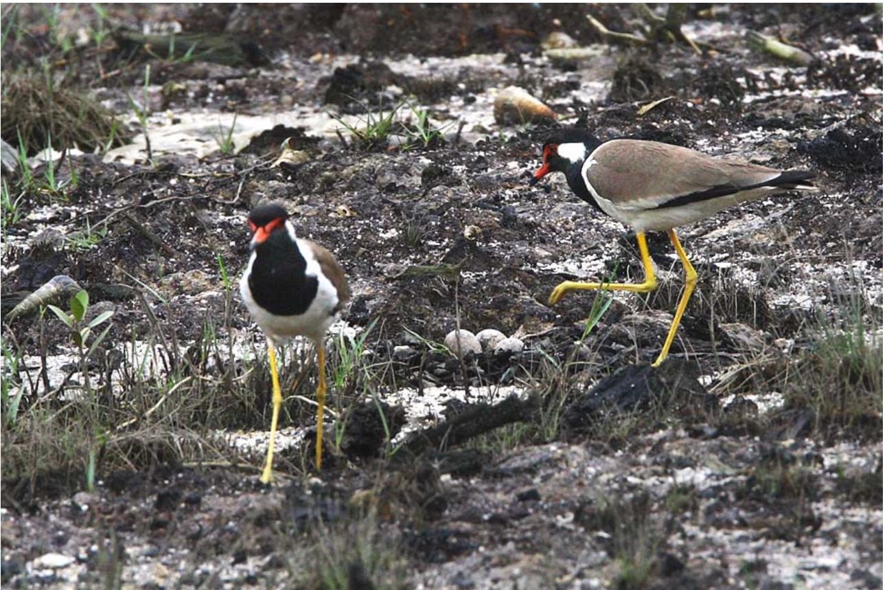
Fig. 11. A pair of red-wattled lapwings nesting at Sungei Buloh Wetland Reserve.