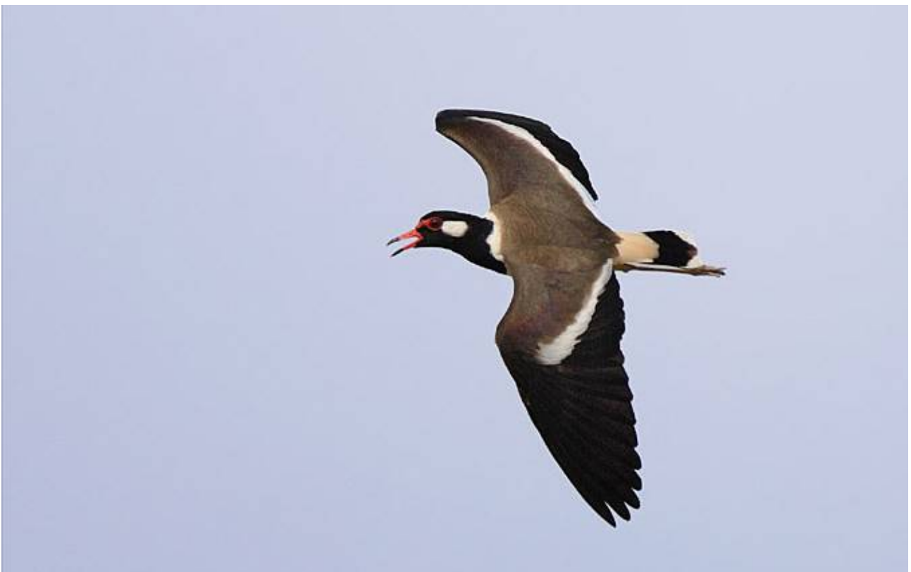
Fig. 3. A red-wattled lapwing ( Vanellus indicus atronuchalis ) showing its comparatively rounded wings.