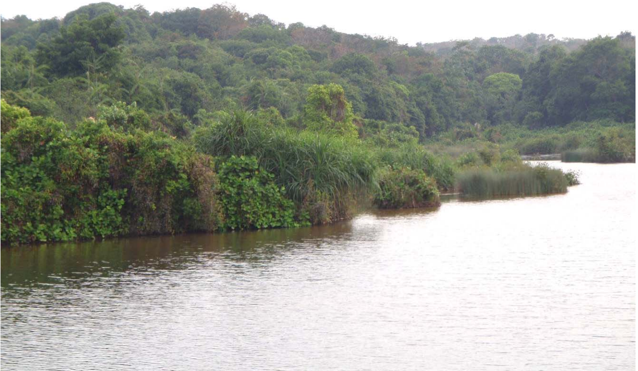
Fig. 10. The freshwater marshy area between the Poyan and Murai Reservoirs.