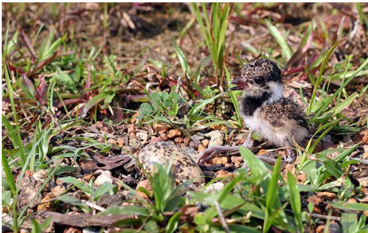
Fig. 5. A red-wattled lapwing ( Vanellus indicus atronuchalis ) nest with a chick and an unhatched egg (Photographed by: Jonathan Cheah Weng Kwong).

the largest lapwing in our region, and it has a grey head, neck and upper breast, a black-streaked breast band, brown upper-parts, white belly, yellow legs and bill tipped with black (Fig. 2).