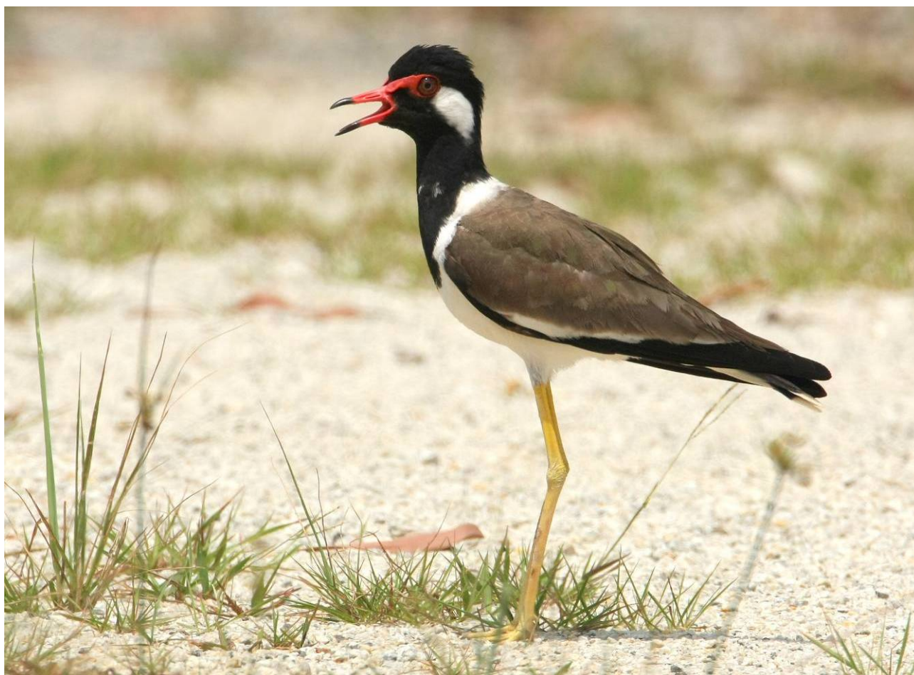
Fig. 1. A red-wattled lapwing ( Vanellus indicus atronuchalis ) seen on open ground at the Western Catchment Area.

Lapwings, like all plovers, are obligate visual foragers, meaning they catch their prey at the substrate boundary layers, by picking small invertebrates from the surface or from low vegetation cover (Piersma & Wiersma, 1996). Although the bills of lapwings do show quite high densities of touch receptors, known as the Herbert Corpucles, they are not arranged