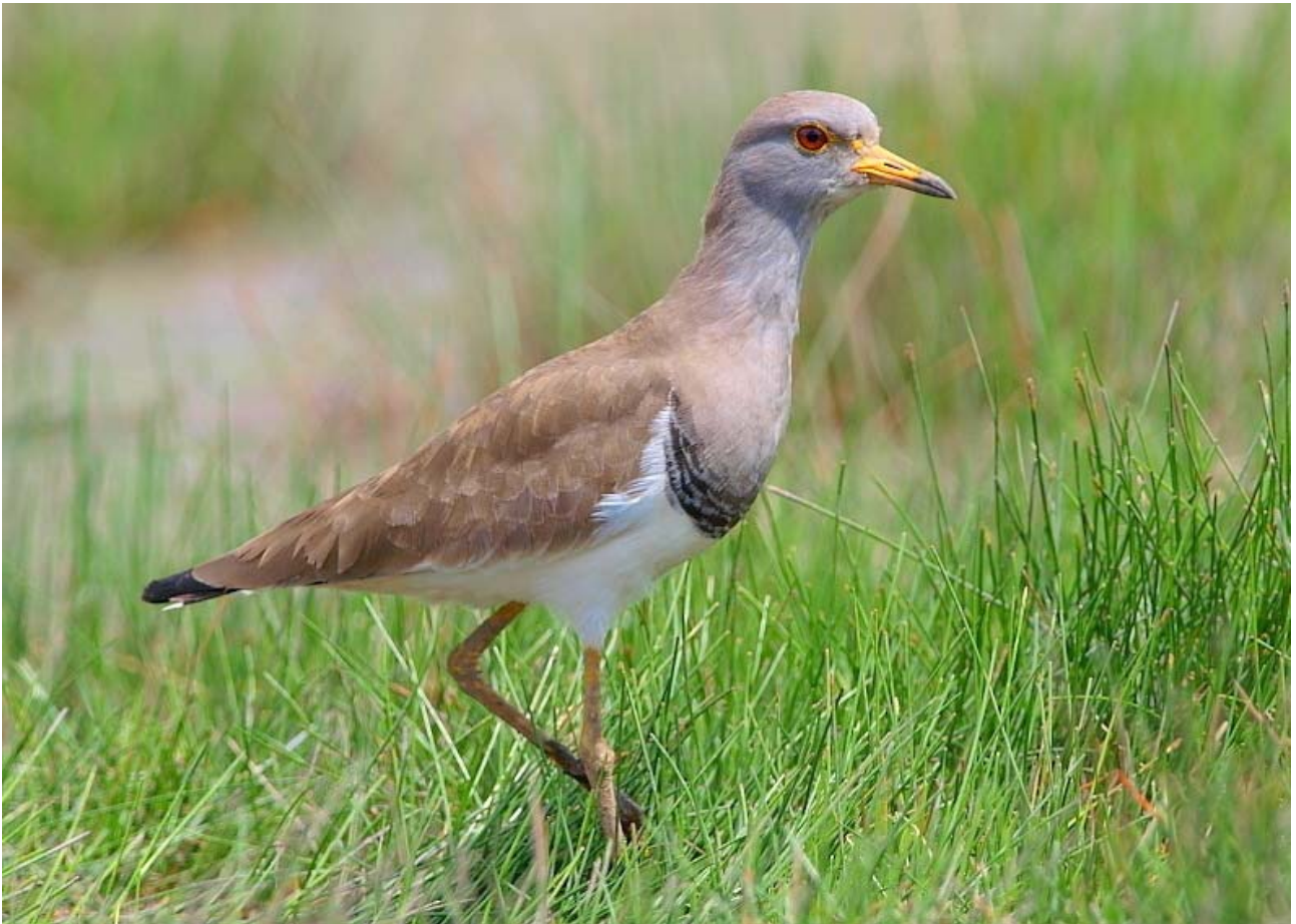
Fig. 2. A grey-headed lapwing ( Vanellus cinereus ) seen at Sungei Balang, Johore, Malaysia.