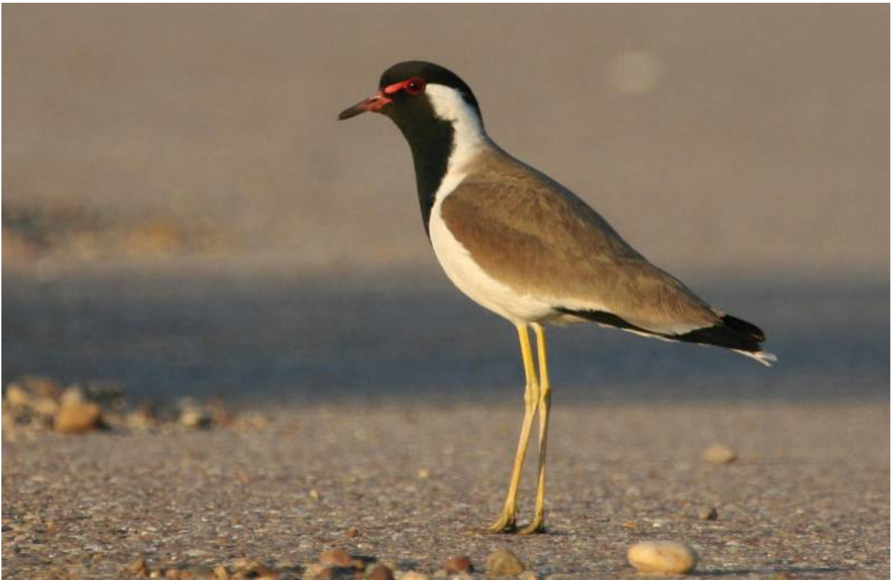
Fig. 4. A red-wattled lapwing ( Vanellus indicus aigneri ) in Baghdad, Iraq.

in complicated arrangements like those found in probe-feeding, scolopacid waders. Because of the visual hunting style of lapwings and other plovers, their optic lobes are twice those of probe-feeding sandpipers. In earlier classifications of the Charadriidae, the width of the bone between the eyes was used as a critical character, as well as the size of the area of the forehead, where the paired salt-glands are sited. As lapwings tend to frequent freshwater habitats, their salt-excreting glands are rather small.