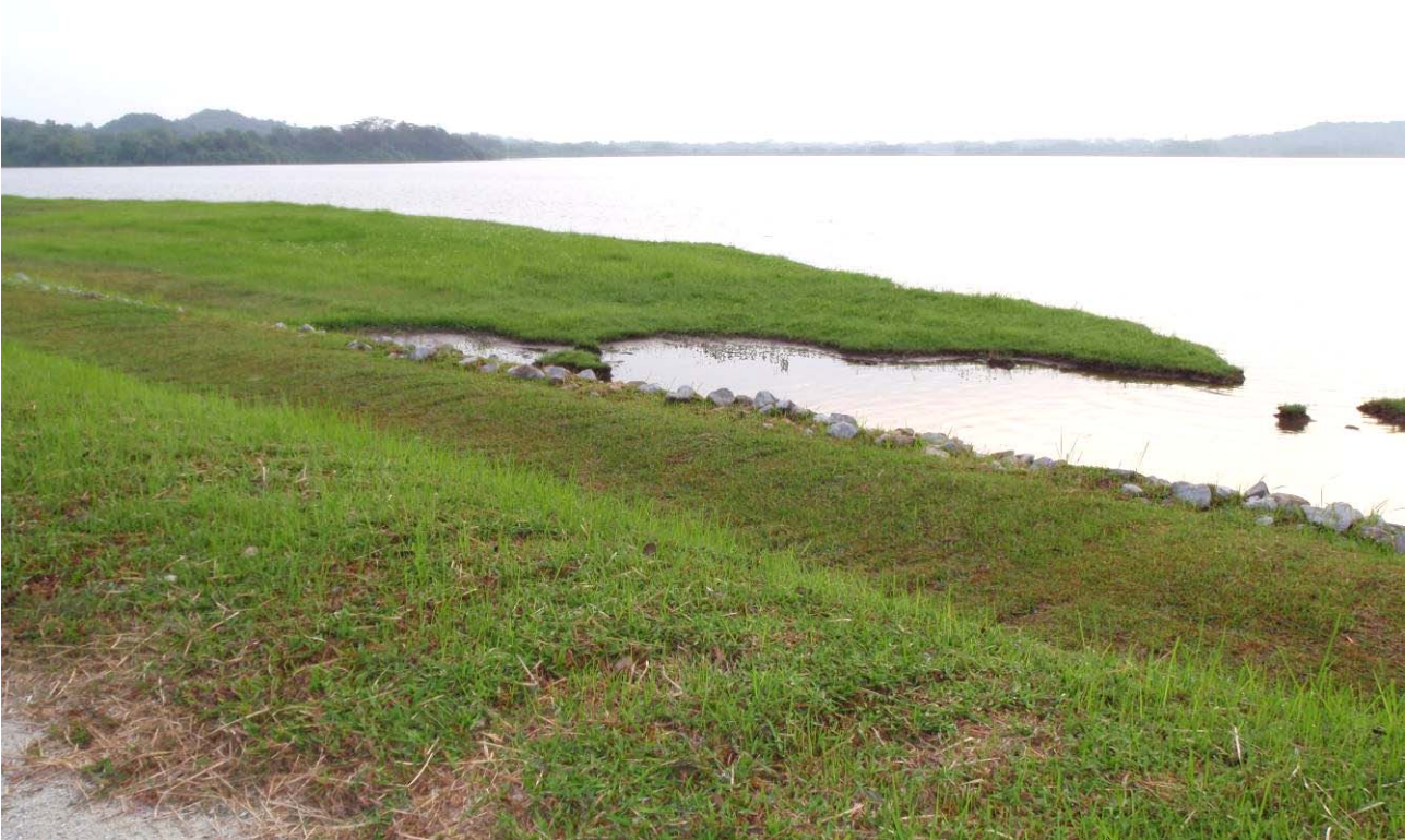
Fig. 9. Swampy patches of grass adjacent to the dykes at Poyan Reservoir. (Photograph by: Alvin Francis Lok Siew Loon).