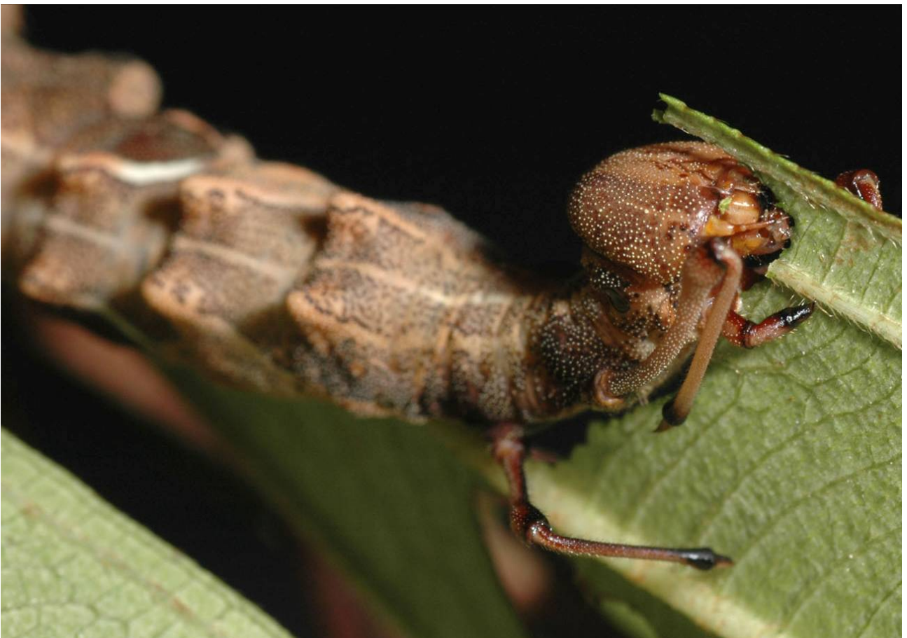
Fig. 4. While feeding, the larva gently taps the leaf blade on both sides with its thoracic limbs.