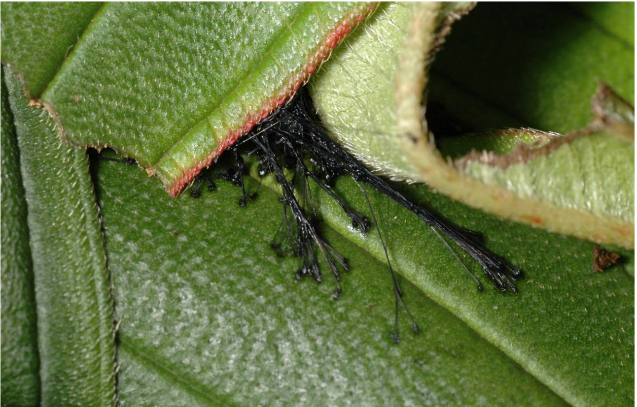
Fig. 6. Black silken threads were used to spin together adjacent, live leaves to construct its cocoon.