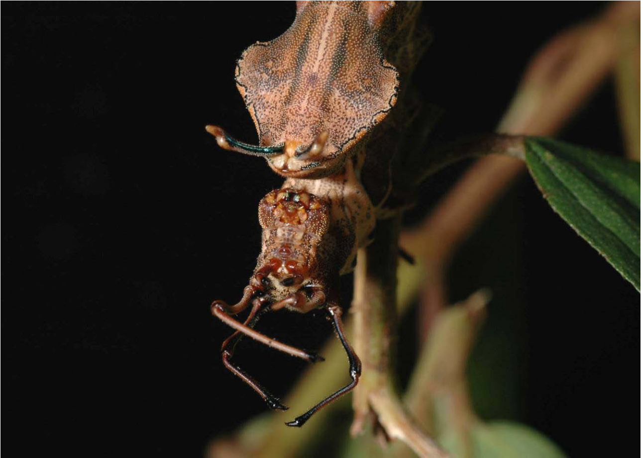
Fig. 5. When alarmed, the larva was observed to suddenly throw its thoracic limbs wide open and vibrate them for a few seconds. This was also accompanied by the parting of its anal prolegs (seen here above its head). Such a visually startling display may serve to ward off any potential predators.