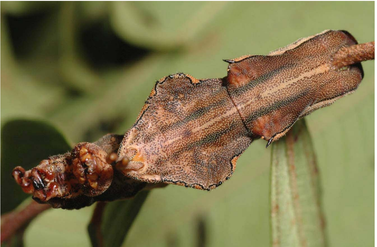
Fig. 3. Ventral aspect of posterior portion of abdominal segments. Note the degree of lateral expansion in the seventh and eighth segments, with a pair of sharp spines on the seventh.