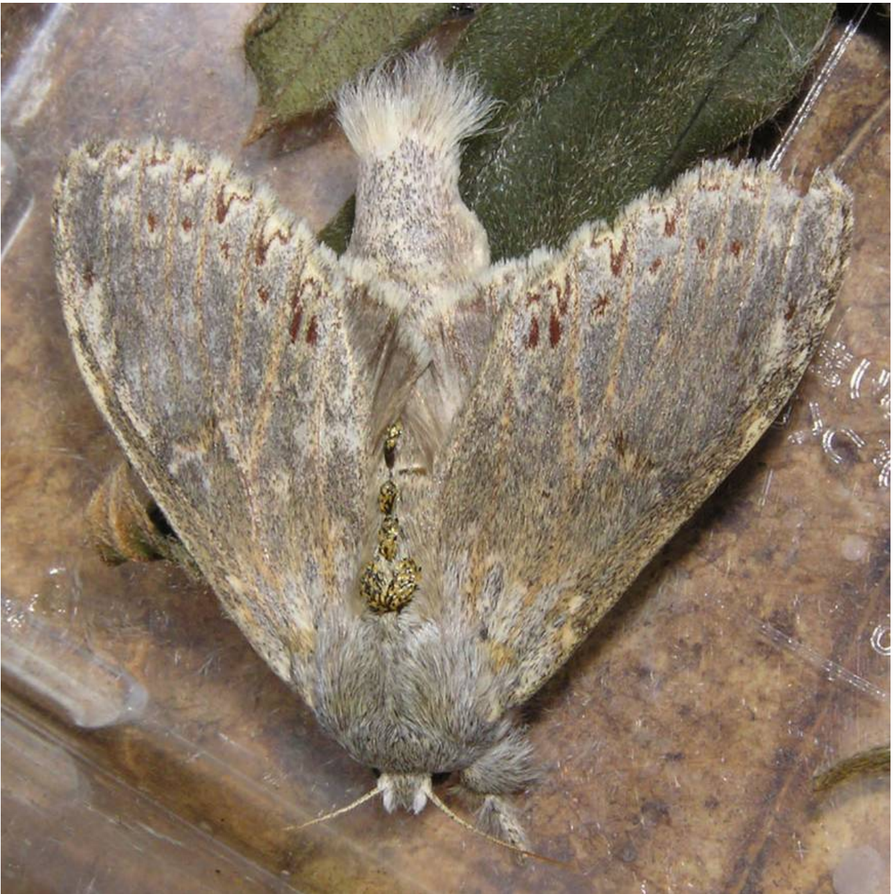
Fig. 7. Recently emerged adult female (ZRC.LEP.46), 30 mm body length, after spending 10 days within its cocoon.