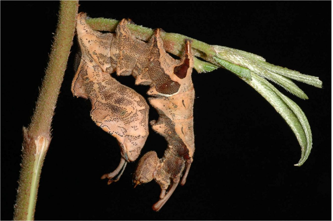
Fig. 1. Cryptic posture of final instar larva of Neostauropus alternus perched on its hostplant, Melastoma malabathricum . Note its elongated thoracic legs, especially the second and third pairs and the pronounced, paired dorsal humps at its first four abdominal segments. The seventh and eighth abdominal segments have laterally protruding expansions. Its posterior-most segment bears a pair of club-like anal prolegs, curved towards their apices. When subsequently outstretched, the total length of the larva was measured to be 70 mm.