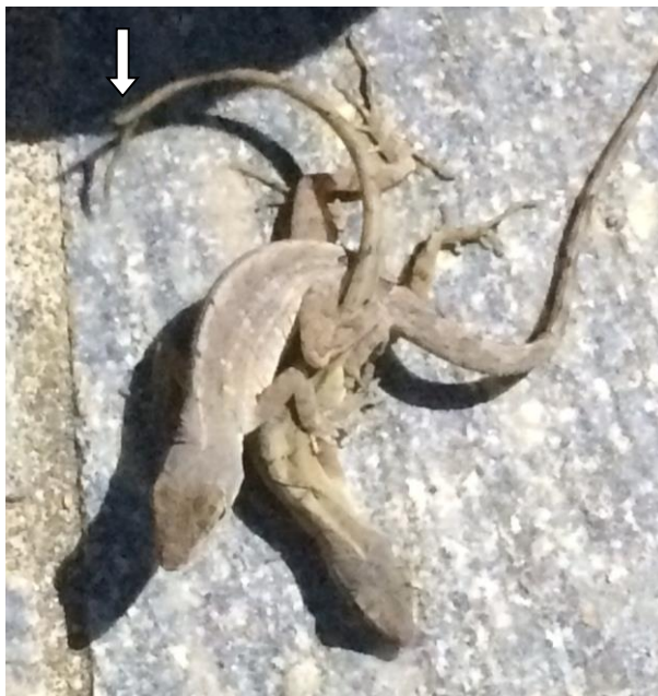
Fig. 4. Dorsal view of copulating anoles. Note the female's bifurcated tail tip indicated by arrow.