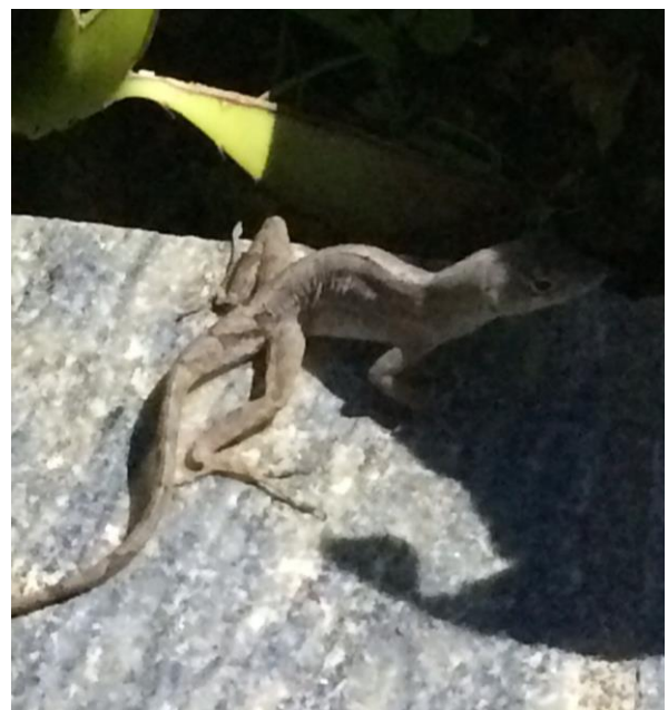
Fig. 5. Copulation ended when the female scuttled off, leaving the male behind.