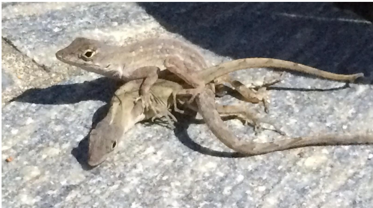
Fig. 1. Lateral view of copulating pair of brown anoles with the male on top.

Remarks: There appears to be no distinct sexual dimorphism on the copulating lizards. The male in the present observation does not seem to have the bright red throat sac or dewlap that is characteristic of courting male brown anoles (see Tan & Lim, 2012: 360, fig. 1). The dull colouration of the featured male suggests that he could be a subordinate masquerading as a female, so he can secretly mate with the females and avoid detection and eviction by the dominant territorial male. The non-native brown anole was first observed in Singapore in 2012 at the Marina Bay area, probably introduced with ornamental plants (Tan & Lim, 2012). One example seen at Bishan in March 2015 appears to be the first published record of the brown anole outside the Marina Bay area (Woo & Wee, 2015: 61).