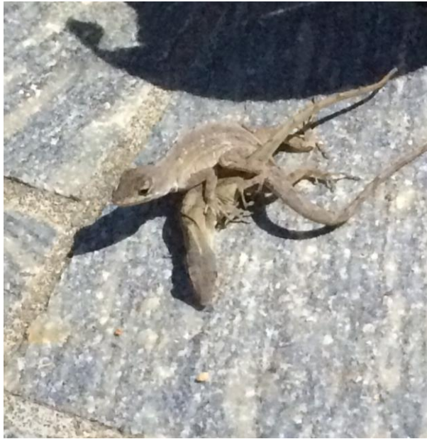
Fig. 2. Copulating pair of brown anoles.