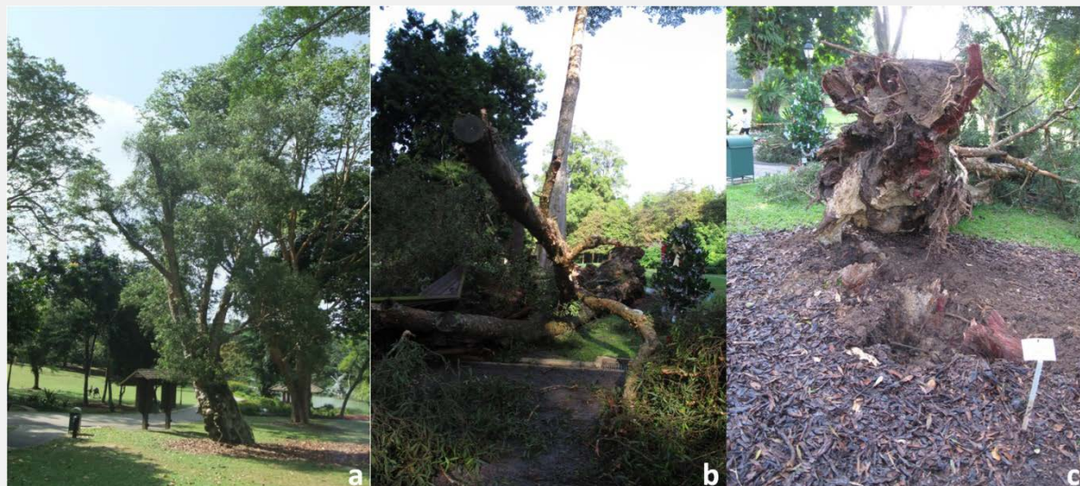
Fig. 1. Melaleuca cajuputi in Lawn H of the Singapore Botanic Gardens. a) tree upright on 20 February 2012, b) tree fallen on 19 December 2012, and c) root zone of fallen tree on 19 December 2012.

The fruiting body of the fungus, potentially Ganoderma , was observed (Fig. 2.b.iv, 2.b.v and 2.b.vi). The wood of the tree, normally dark red and hard (Fig. 2.c.i), appeared to be brittle. In the area affected by the fungus, it is white with distinct pattern of black lines (Fig. 2.c.ii). The greatest quantity of fungus-decayed wood was found at the base of the tree, along with the fruiting body (Fig. 2.b.i and 2.b.iii). The proportion of decayed wood was lower higher up the tree. Only a small amount of decay was observed at 3 m above ground (Fig. 2.a.i and 2.a.ii). Fig. 2.b.ii shows the spread of the fungus from decayed wood into solid wood, note the distinct difference in the colour of the wood.