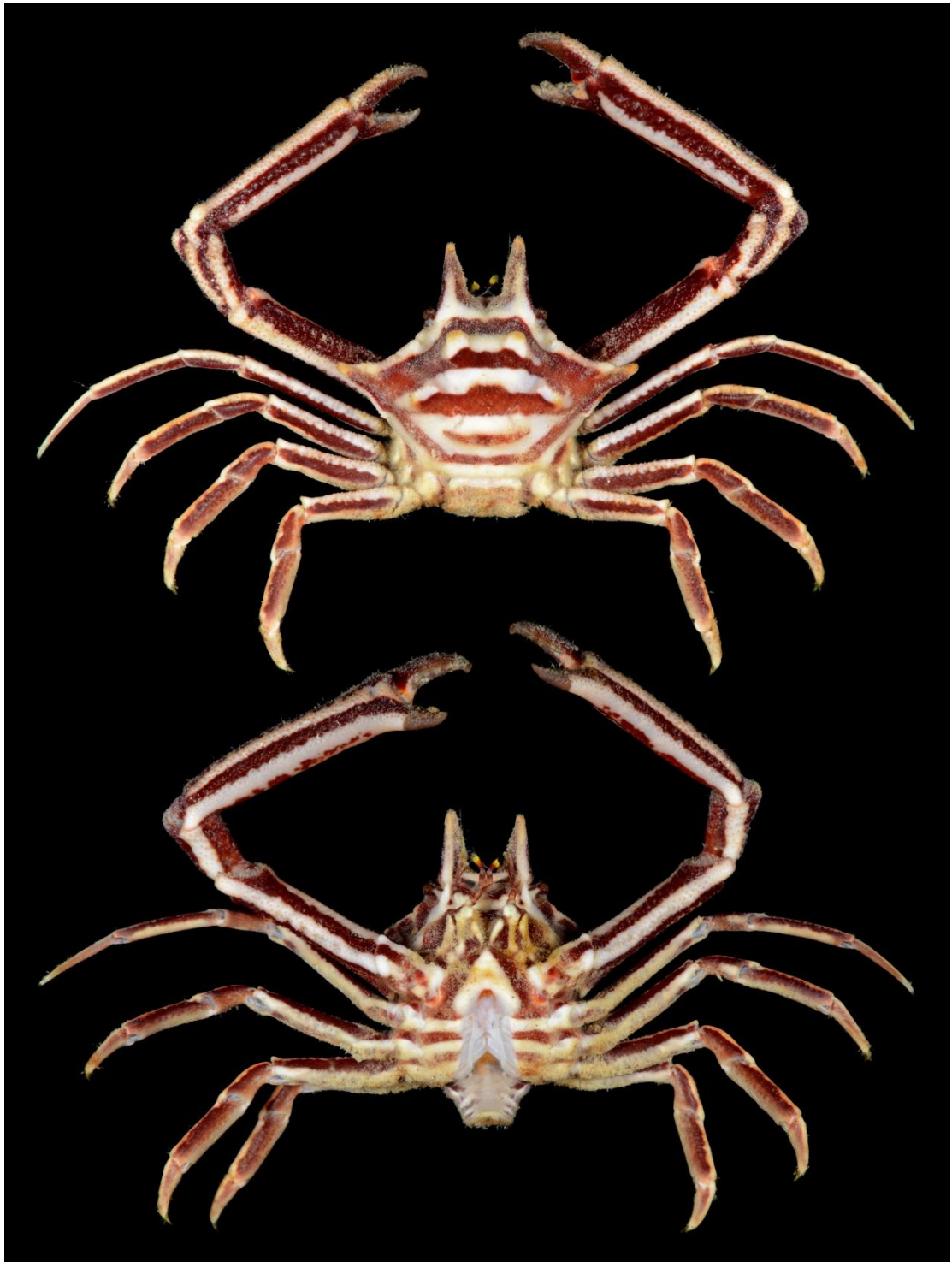
Fig. 2. Dorsal (top) and ventral views of Ceratocarcinus longimanus (ZRC 2014.0290), male of 13.0 mm carapace width.