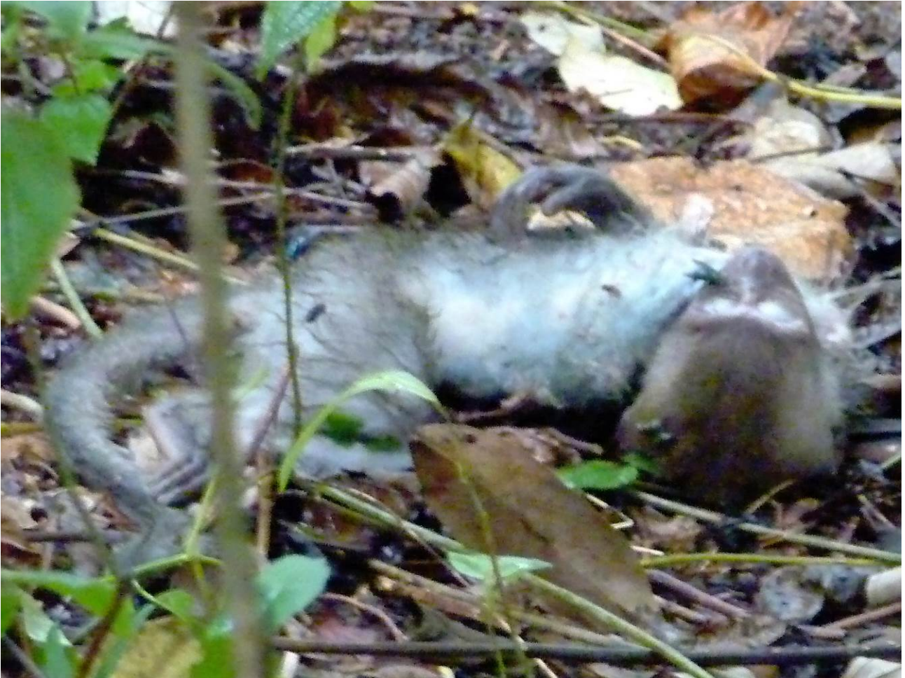
Fig. 2. Temporarily abandoned body of juvenile macaque.