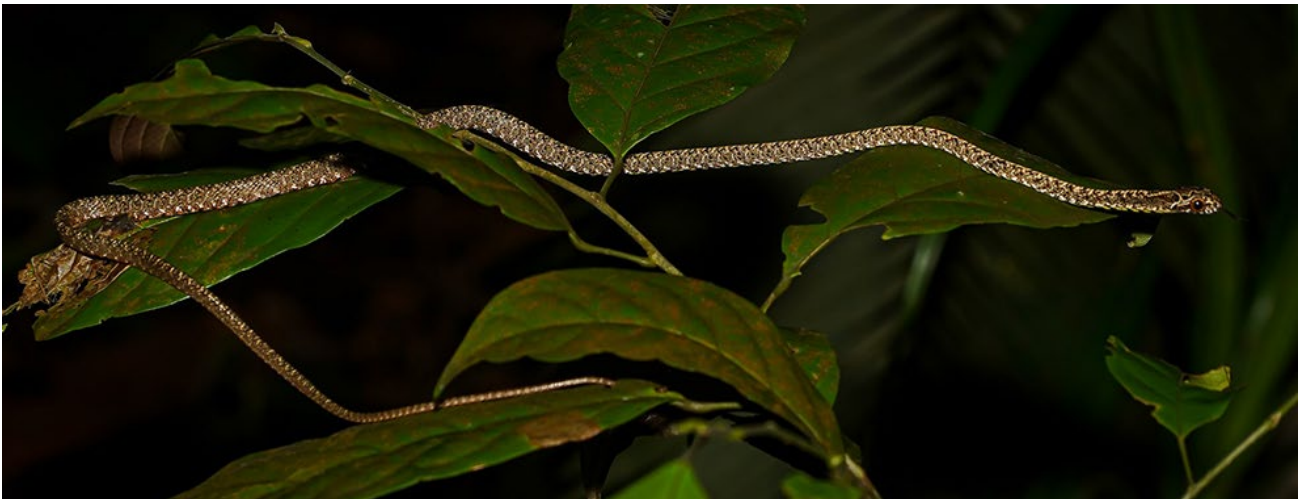
Fig. 1. Lateral view of the entire snake, in-situ.

Observation: A juvenile example of around 35–40 cm (Figs. 1–4) was observed on a low shrub at the forest edge.