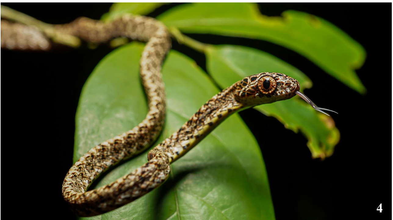
Fig. 2. Lateral view of the head and neck of the subject, with tongue extruded. Fig. 3. Dorsal view of the subject's head and neck. Fig. 4. Lateral view of the head and neck, and dorsal view of the anterior body (Photographs by: James Chua).