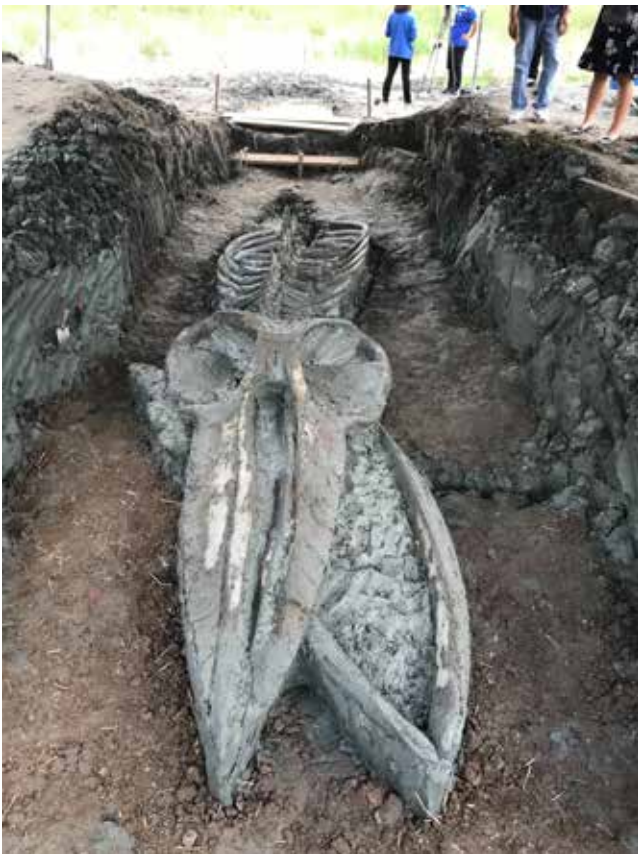
Fig. 2. The ancient Bryde's whale remains were discovered from Bangkok clay about 12 kilometres inland from the current coastline, the Gulf of Thailand.