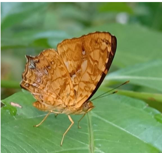
Fig. 1. Lateral view of the featured Malayan jester.

Khew SK (2019) The Malayan Jester – permanent resident? A species here to stay? Butterflies of Singapore. A Tribute to Nature’s Flying Jewels. https://butterflycircle.blogspot.com/2019/02/the-malayan-jester-permanent-resident.html (Accessed 7 August 2021).