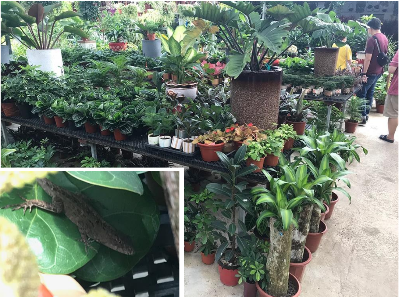
Fig. 1. View of the plant sales section of the nursery at Bah Soon Pah Road, with inset showing the brown anole hiding among the plants.