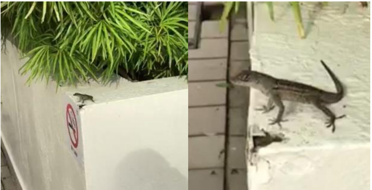
Fig. 2. View of a planter box at HDB Hub, Toa Payoh Central, showing the lone brown anole at the corner of the ledge. The photograph on the right shows a closer view of the anole.