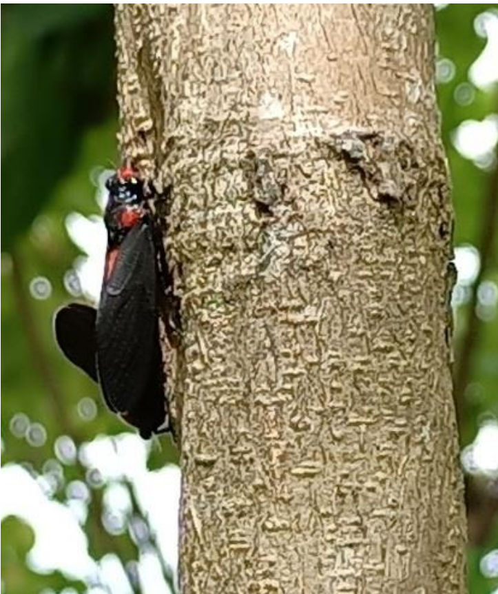
Fig. 2. Lateral view of a mating pair of black and scarlet cicadas on a trunk of a bush.