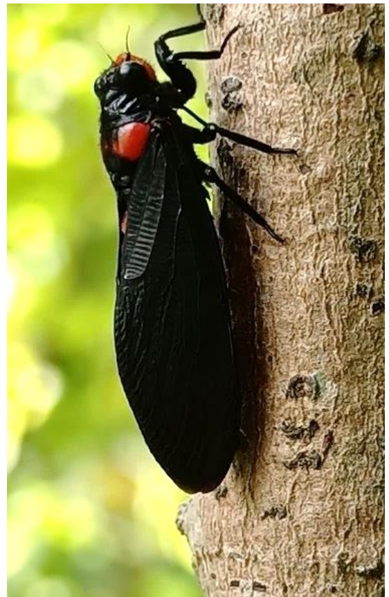
Fig. 3. A lone black and scarlet cicada on a different trunk. (Photograph by: Simon Chan Kee Mun).