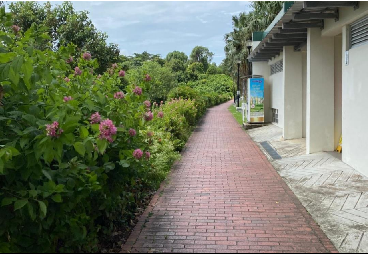
Fig. 3. Kent Ridge Park, where the Danaid eggfly was found among vegetation beside the toilet building.