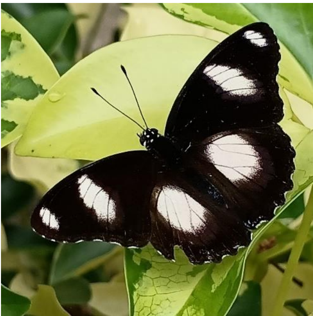
Fig. 1. Dorsal view of male Danaid eggfly. (Photograph by: Simon Chan Kee Mun).

Observation: On that very cloudy afternoon, a male example (Figs. 1, 2) with a forewing length of about 4 cm, was spotted flying rapidly amongst free-flowering bushes along a paved path beside a public toilet building (Fig. 3).