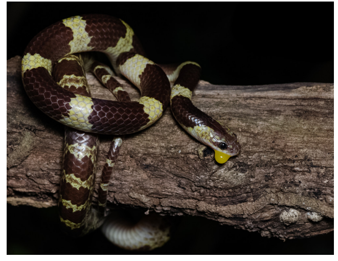
Fig. 1. A photograph of a bridle snake ( Lycodon cf. davisonii ) having just consumed a bird's egg on 27 June 2019 at 2358 at the Sakaerat Environmental Research Station, north-eastern Thailand.

Nest monitoring and nest predator identification. We deployed cameras at 478 natural nests of 23 species of birds. More than 90% of monitored nests (439 nests) were those of the eight focal species whose nests could be relatively easily found and monitored including Abbott's babbler (26 nests), black-naped monarch (35 nests), Indochinese blue-flycatcher (42 nests), puff-throated babbler (70 nests), puff-throated bulbul (38 nests), scaly-crowned babbler (128 nests), stripe-throated bulbul (25 nests), and white-rumped shama (75 nests). We documented 308 predation events by 15 nest predator species (Table 1), 42 predation events by unknown predators (cameras failed to detect predators), 42 events of non-predation failures (e.g., abandonment by the adults, nest damage during storms), and 86 nest successes. Of those 308 predation events, we found that bridle snake (Fig. 1) was the third most important nest predator in our study area accounting for 13% (41 predation events) of all predation