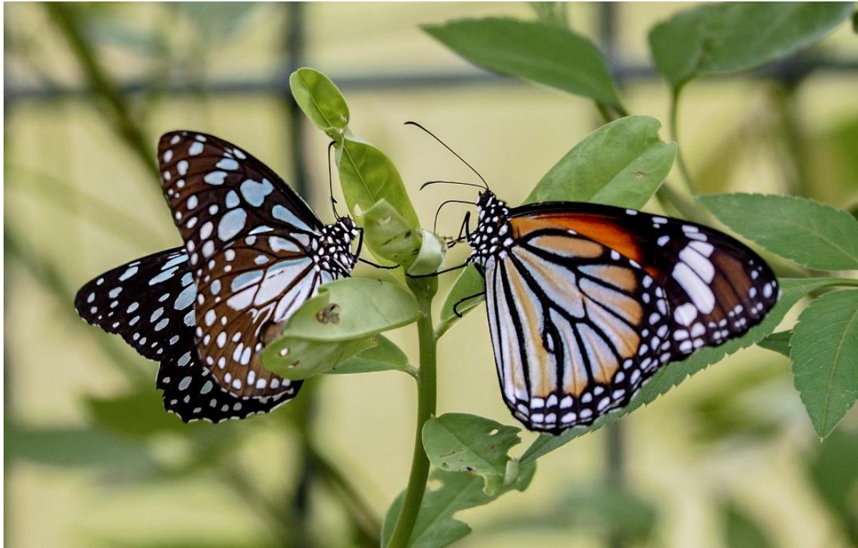
Fig. 2. Tirumala limniace and Danaus genutia (right) feeding on the leaf of Crotalaria retusa at 1538 hrs on 6 January 2016.