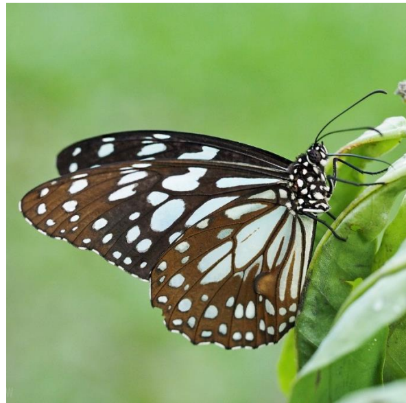
Fig. 4. At 0809 hrs on 7 January 2016, Tirumala limniace was feeding on the leaf of Crotalaria retusa .