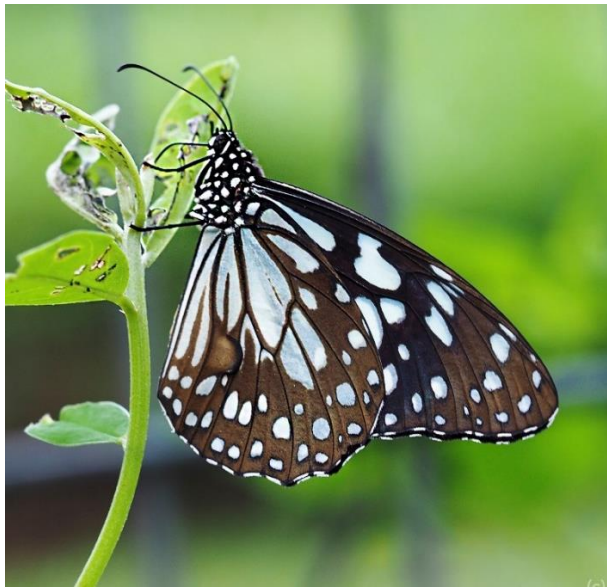
Fig. 3. Side view of Tirumala limniace on Crotalaria retusa at 1546 hrs on 6 January 2016.