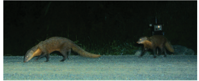
Fig. 1. Collared mongoose Herpestes semitorquatus camera-trapped in Deramakot Forest Reserve, Sabah, Malaysia on 12 August 2008.