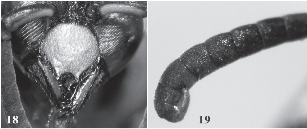
Figs. 18–19. Malayepipona seomyty , new species. Male: 18, clypeus and mandible in frontal view; 19, left antenna.