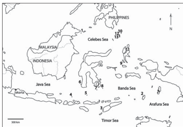
Fig. 1. Map showing the localities where Acropora corals were sampled during the first Snellius expedition, numbers correspond with Table 1.

A total of 69 Snellius corals were identified as belonging to eight species of the Acropora humilis group: A. humilis (Dana, 1846), A. gemmifera (Brook, 1892), A. monticulosa (Brüggemann, 1879), A. samoensis (Brook, 1891), A. digitifera (Dana, 1846), A. multiacuta Nemenzo, 1967, A. retusa (Dana, 1846) and A. fastigata Nemenzo, 1967. These species were found at 13 Snellius stations (Table 1). In addition, seven specimens collected by Dr Brongersma and Dr Umbgrove in the Togian Islands and Sorido (Biak,