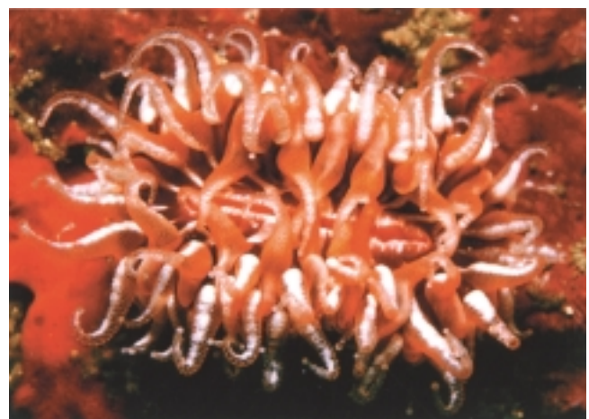
Fig. 1. Javania erhardti, in situ photograph of paratype from Canibal Rock, Isla Rinca (USNM 1010487), x 1.75.