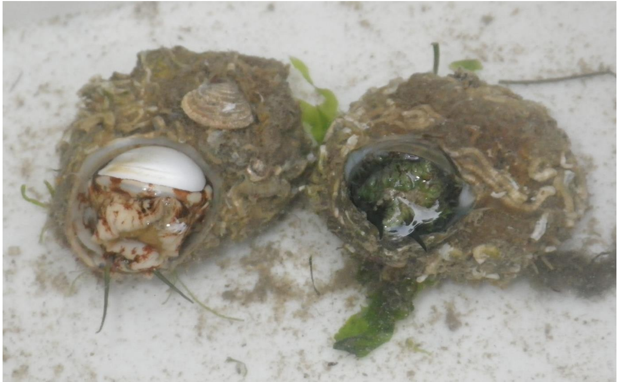
Fig. 2. Distinctly different colouration of the soft body and operculum of Turbo heterocheilus (left) and Turbo intercostalis (right).