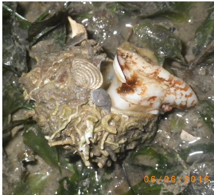
Fig. 1. Turbo heterocheilus in situ.

Turbo heterocheilus can be easily distinguished from its congeners in Singapore by its white operculum (Fig. 2), and sculpture of beaded spiral cords (Fig 3). Turbo marmoratus is the only other species recorded in Singapore with a similarly white operculum. However it has a smooth shell devoid of spiral ribs (see Tan & Low, 2013).