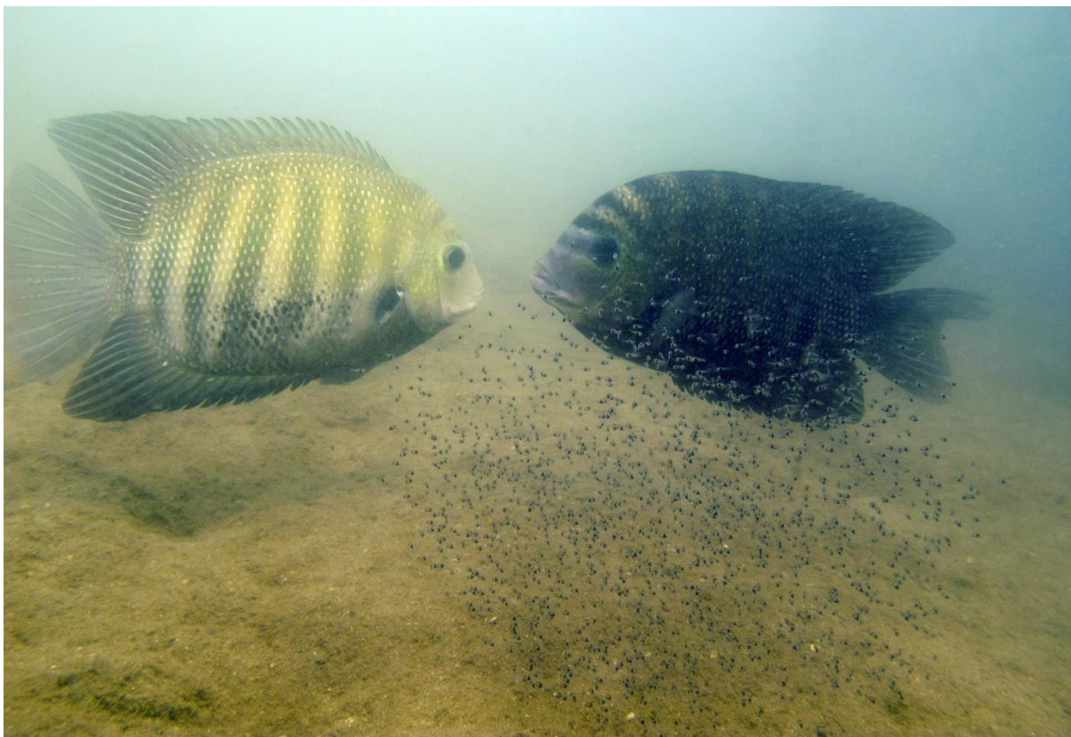
Fig. 2. Adult fish interacting with each other behind their swarm of fry.