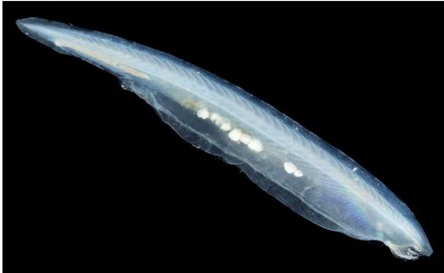
Fig. 3. Lateral view of Individual 2 of Epigonichthys cultellus before preservation. Head points to the right. Note the presence of some segmented gonads.

Remarks: Lancelets are fish-like animals that have no true skeleton. They filter-feed from the water column and tend to conceal themselves in the substrate, half-buried in the sediment (Zimmer, 2000). Although they are not easy to spot, lancelets have been harvested commercially as food for humans elsewhere (Boschung and Shaw, 1988). Two species are previously known from Singapore: Branchiostoma belcheri (Gray) and Branchiostoma malayanum Webb.