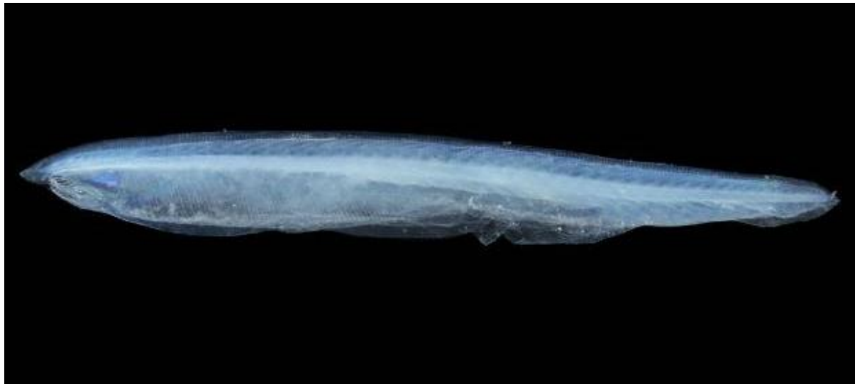
Fig. 2. Lateral view of Individual 1 of Epigonichtys cultellus before preservation. Head points to the left.

Meristic and descriptive characters of the four specimens are shown below. Characters of Branchiostoma malayanum originally described from Singapore (Webb, 1956) are listed for comparison: