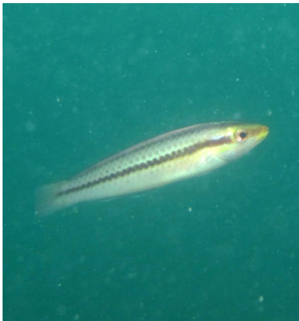
Fig. 1. The single example off Sisters Islands.