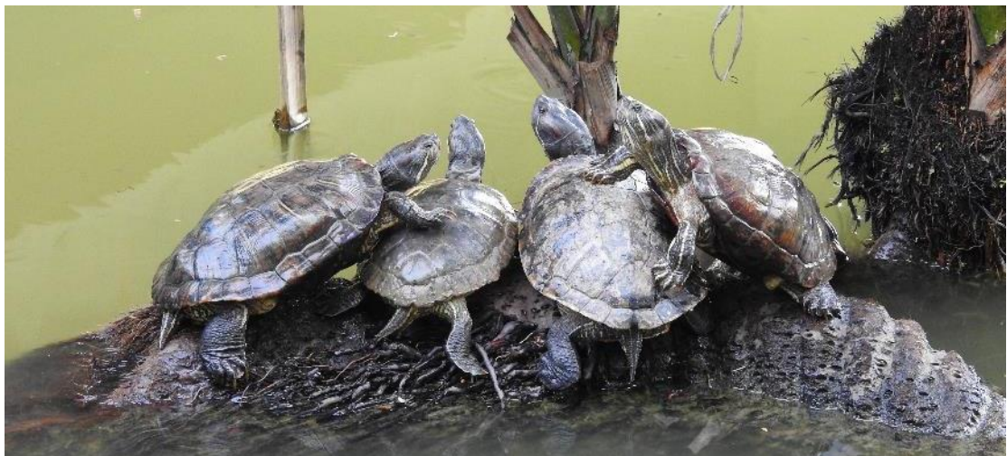
Fig. 4. A group of basking Trachemys scripta elegans . Largest example of about 25 cm carapace length.