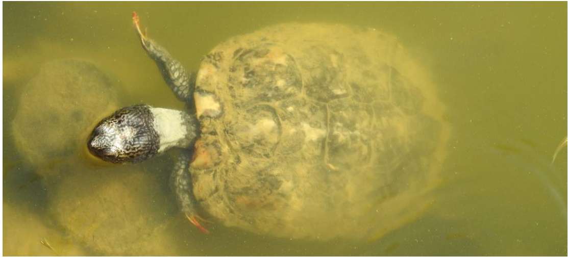
Fig. 2. This example of about 20 cm carapace length is tentatively identified as Trachemys decussata .