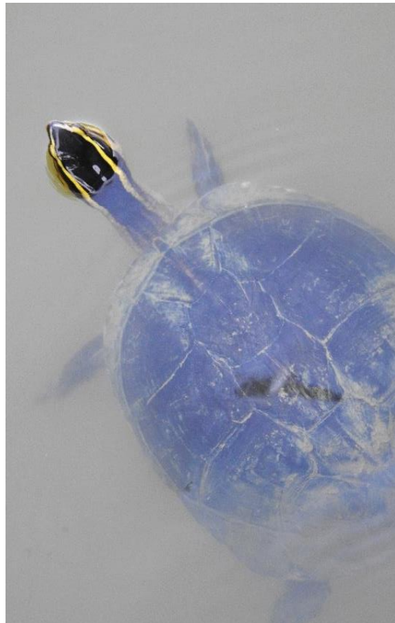
Fig. 1. Cuora amboinensis of about 20 cm carapace length.