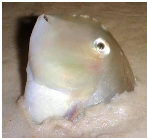
Fig. 1. Triplebar razorfish found alive with its head exposed.

Observation: An example was found buried in the damp substrate with its head sticking out (Fig. 1). It was collected and measured 105.8 mm from snout tip to tail base (Fig. 2).