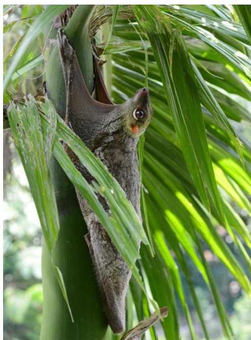
Fig. 1. Malayan colugo on a betel nut palm.