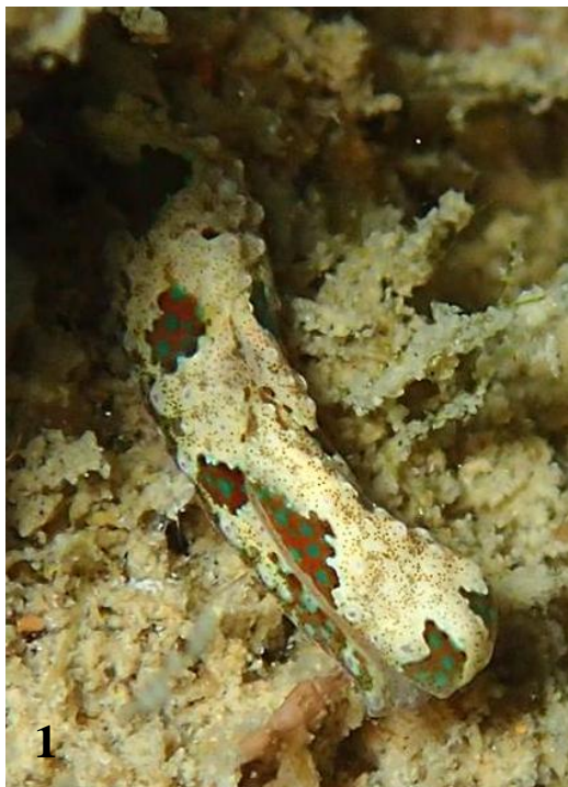
Fig. 1. Odontoglaja guamensis specimen on the reef. Head of the animal pointing towards lower right corner.