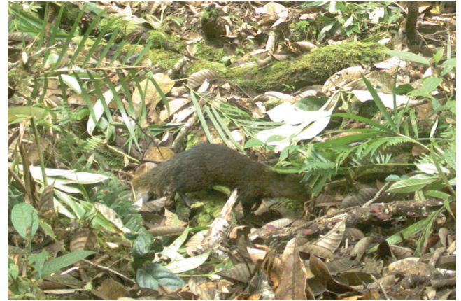
Fig. 1. Short-tailed mongoose Herpestes brachyurus , Paya Maga, Sarawak, at 1548 m a.s.l., close to the highest altitude at which the species has ever been recorded; 24 November 2014.

Collared mongoose and brown mongoose H. fuscus Waterhouse, of southern India and Sri Lanka have each been considered conspecific with short-tailed mongoose, by, e.g., Schwarz (1947) and Wozencraft (1993) respectively. Although the specific statuses of these two are now universally accepted, taxonomic uncertainty remains with short-tailed mongoose. A single mongoose specimen from the Baram district, Sarawak, with a distinctive skull was named as Hose's mongoose H. hosei Jentink. No similar specimens have since been collected and this specimen is now