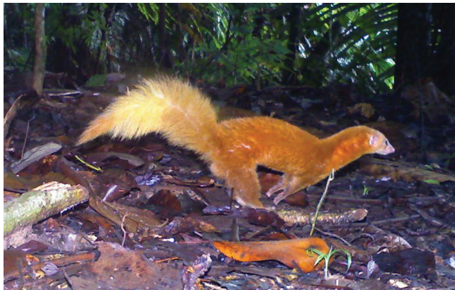
Fig. 1. Malay weasel Mustela nudipes camera-trapped in Crocker Range Park, Sabah, Malaysia at 885 m a.s.l. on 4 November 2011.

M 1 = Balanced Model; M 2 = Spatial Filtering Model (2 km); *only coarse location description was available