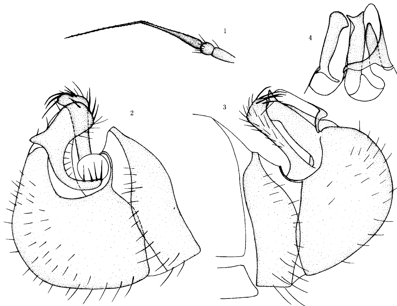
Figs. 1-4. Trichopeza sinensis new species (male). 1. antenna; 2. genitalia, right lateral view; 3. genitalia, left lateral view; 4. genitalia, posterior view.

Abdomen black with pale grey pollen; basal three segments brownish yellow. Hairs and bristles on abdomen black. Tergite 8 and sternite 8 fused into a circular band rather narrow dorsally. Male genitalia (Figs. 2-4): left and right epandrial lamella connected basally by very narrow dorsal sclerite; left surstylus long and rather thick with acute apex; right surstylus shorter than left surstylus, nearly acute in posterior view; left cercus nearly straight with large and